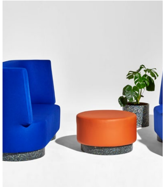
Confetti Large Ottoman recycled plastic base and leather upholstery.