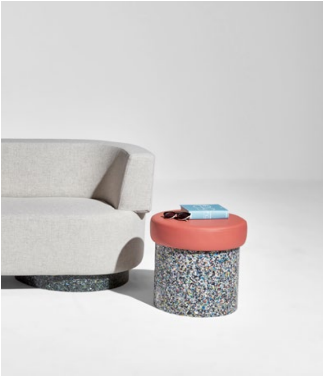
Confetti Small Ottoman recycled plastic base and leather upholstery.