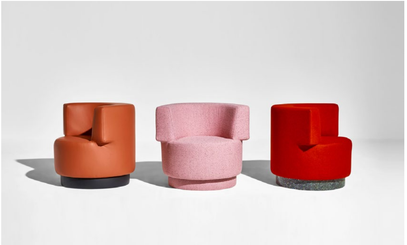
L to R: Confetti Armchair with leather upholstered body and base, Confetti Armchair with fabric upholstered body and base, Confetti Armchair upholstered in fabric with 100% recycled plastic base.