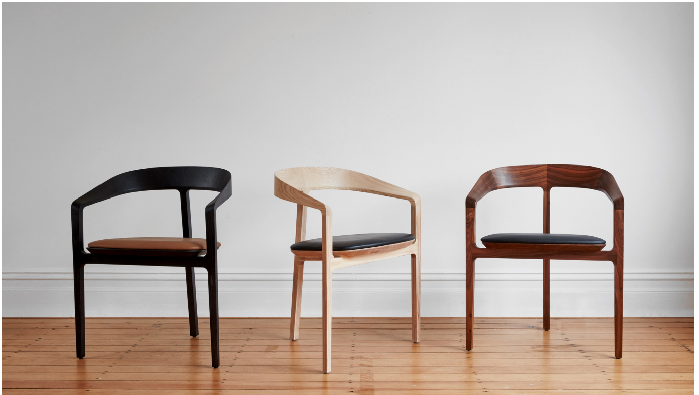
Bow Chairs with leather upholstered seat pads.