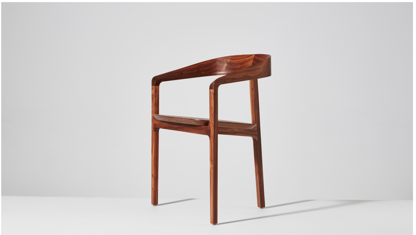
Bow Chair in solid walnut timber.