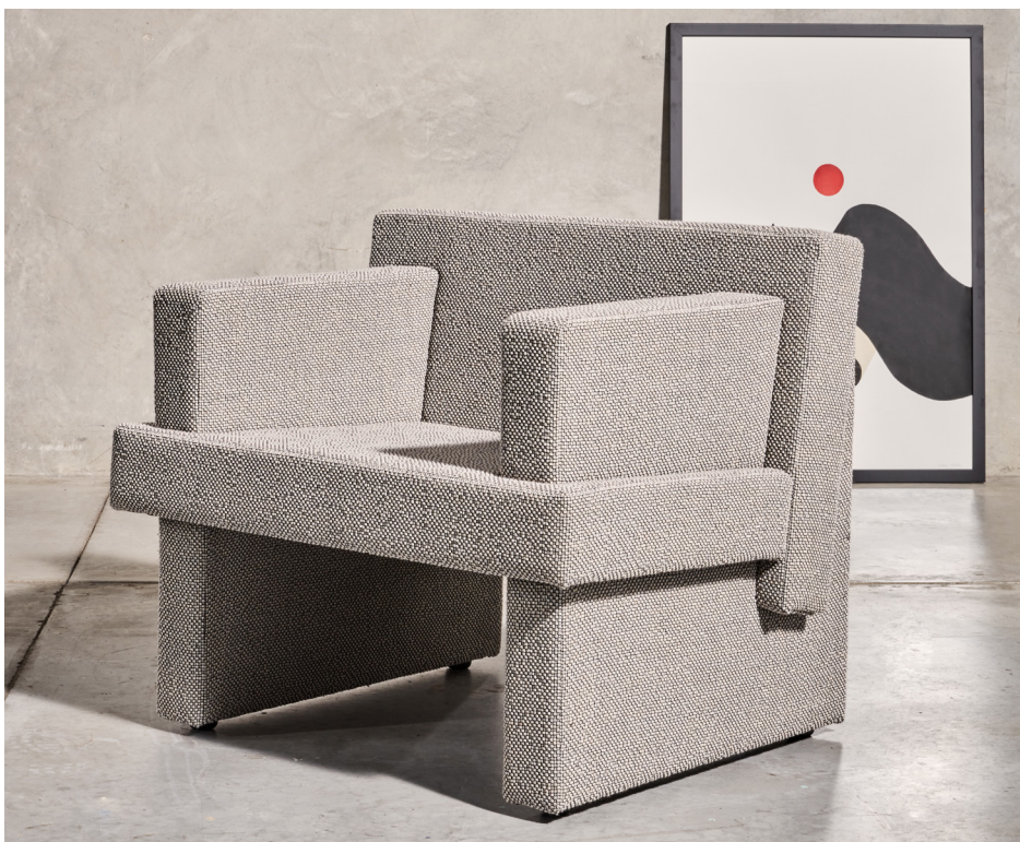
August Armchair upholstered in Kvadrat: Colline 2 0127.