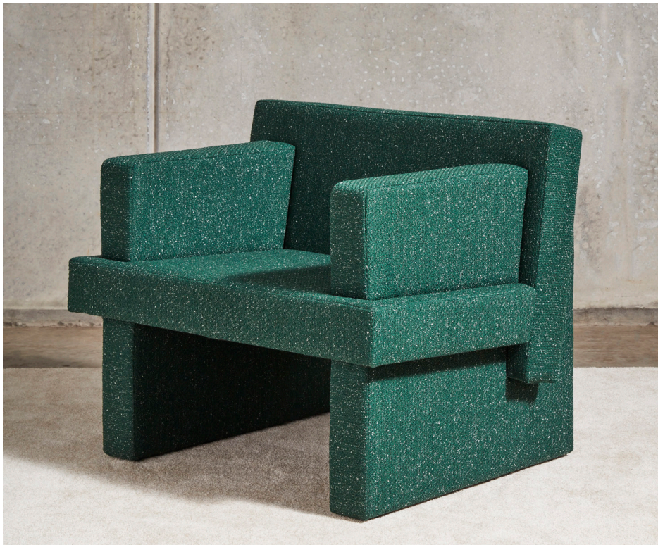
August Armchair upholstered in Kvadrat: Pilot 0972.