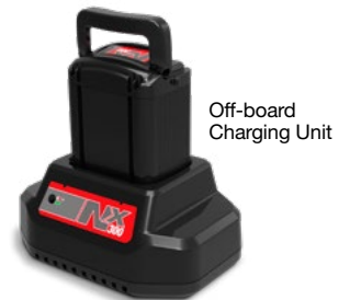
Off-board Charging Unit