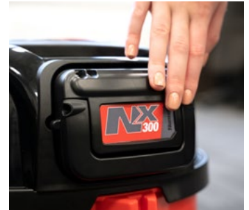
Easy Battery Change