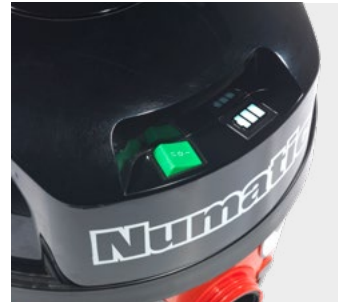
Battery Level Indicator