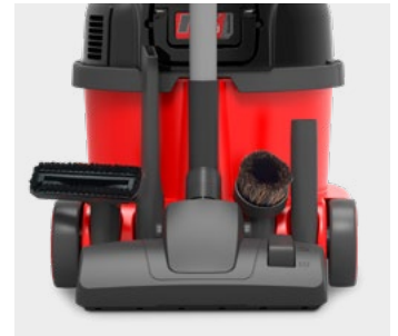
Extra On-Board Tool Storage