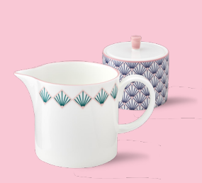
Ziggy Milk and Sugar Gift Set