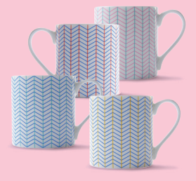
Ebb Mug Gift Set