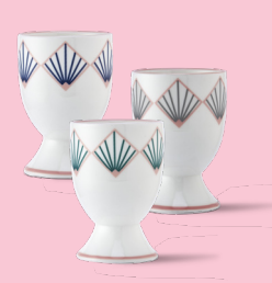
Ziggy Egg Cup Gift Set