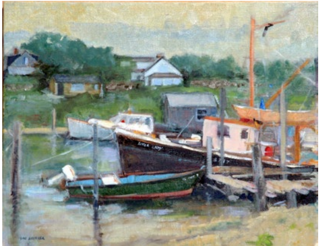
"Little Lady" 16"x20" oil on canvas