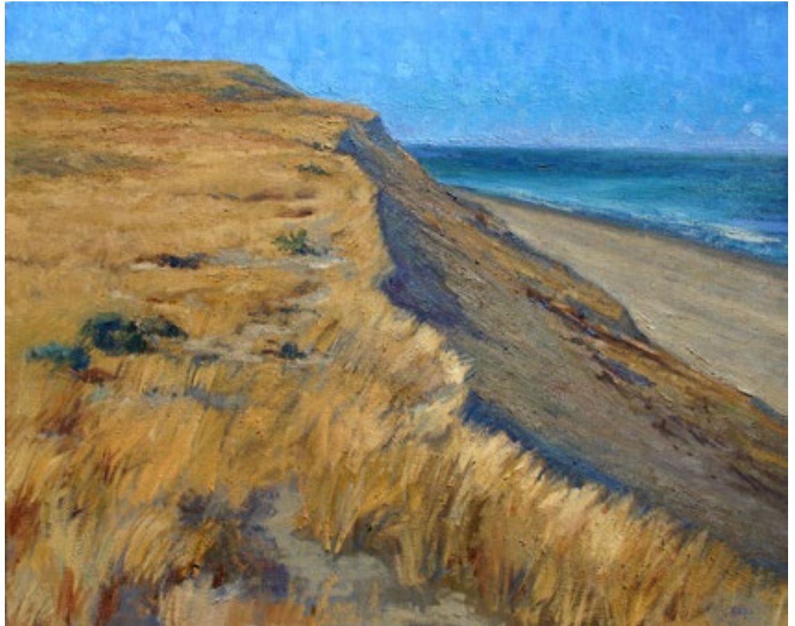
"Into Spring" 24"x30" oil on linen