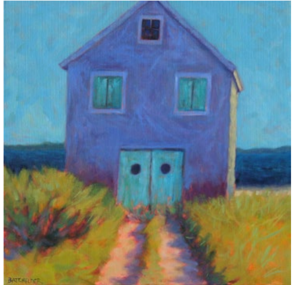
"Beside the Sound" 20"x20" oil on canvas