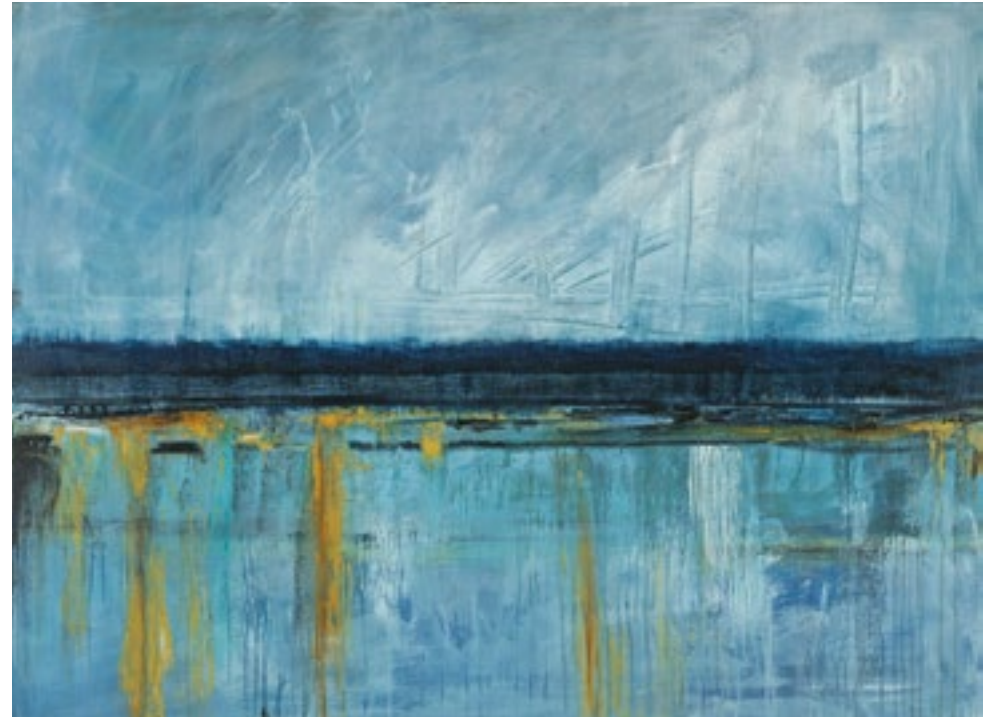
"Bridge" 30"x 40" acrylic on canvas