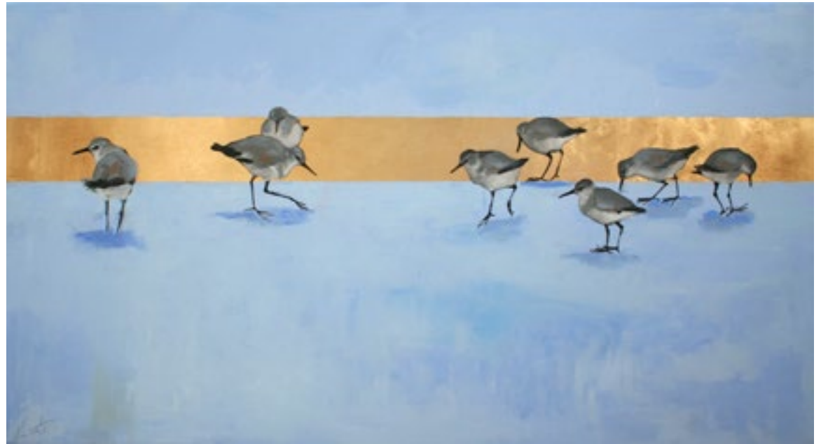
"Summer's Gold" 24"x44" oil on canvas

"I find inspiration in the things that I want to look at. I am interested in making the most beautiful thing possible, and making it simple."