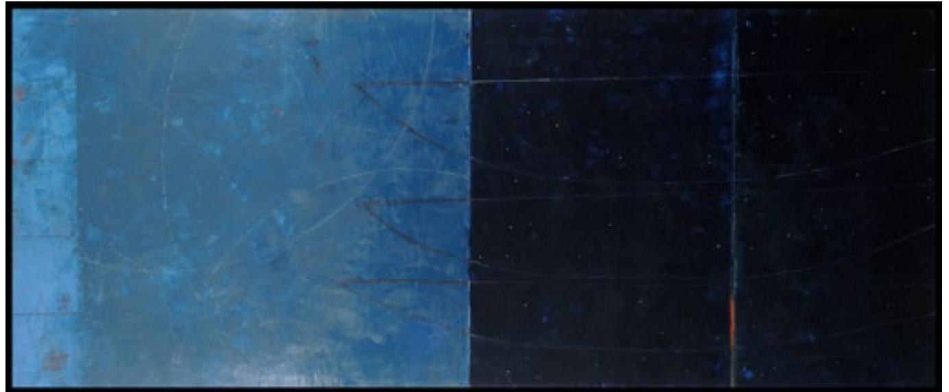
"Destination Blue" 31" x 72" x 2" mixed media

"Graceann Warn is in love with 'terra incognita', a seeker of an elusive 'there' whose identity can only be glimpsed in fragments: a word, a shape, the barest hint of a phrase whose meaning dissolves the instant you think you've grasped it."