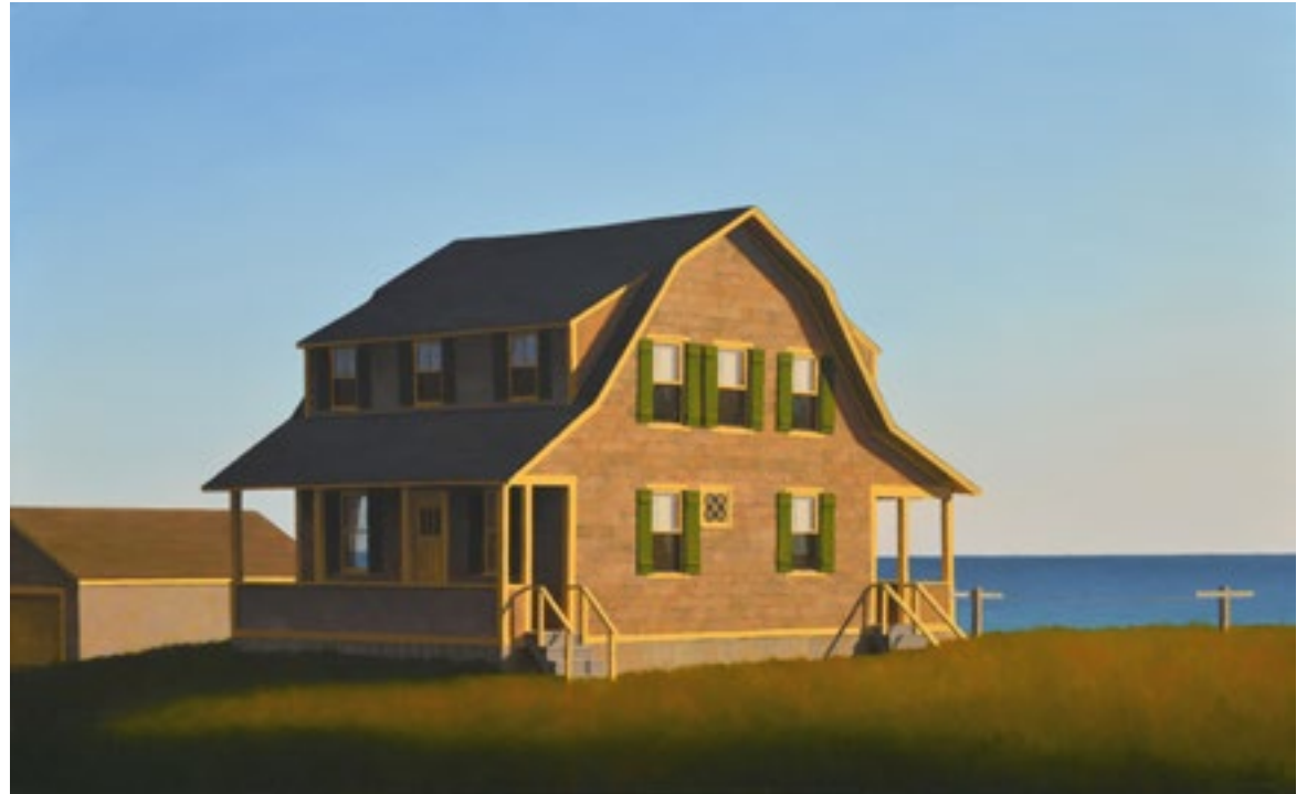
“Seaside Gambrel” 30”x48” oil on canvas