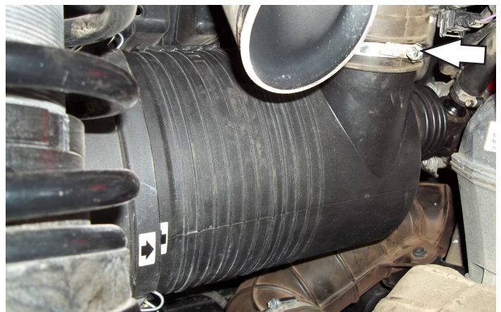
REMOVE AIR BOX