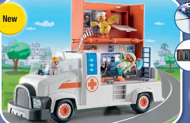
70913 DUCK ON CALL - Ambulance. Opens to reveal a furnished hospital. With lights and sound (batteries required). Length 38 cm / 15 in.