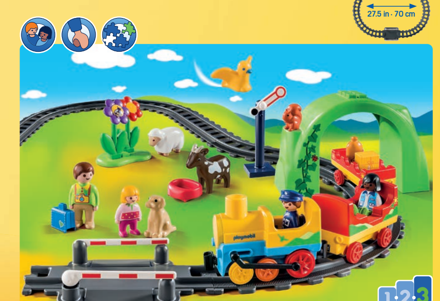
70179 My First Train Set. Interchangable train tracks. Carriages can be connected and disconnected.