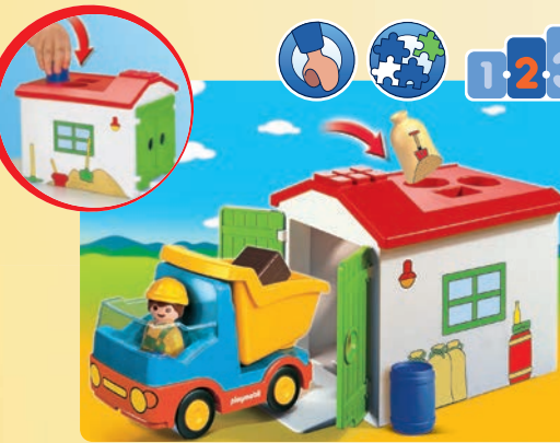
70184 Construction Truck with Garage