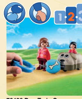
70406 Dog Train Car