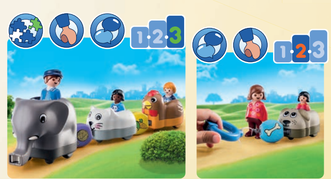
70405 Animal Train