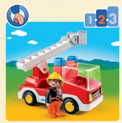
6967 Ladder Unit Fire Truck. Ladder is movable.