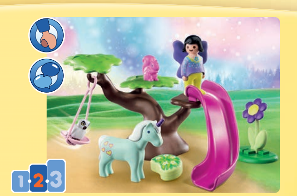
70400 Fairy Playground. The animals gather in the fairy playground. The fairy, squirrel, owl and unicorn entertain the fairy forest with its fabulous stories. With magical swing and slide.