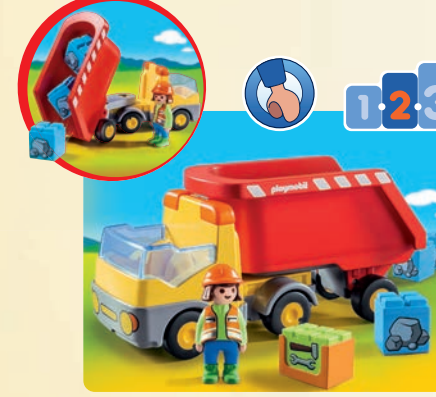
70126 Dump Truck