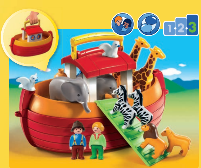
6765 My Take Along 1.2.3 Noah's Ark