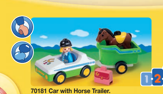
Trailer is detachable.