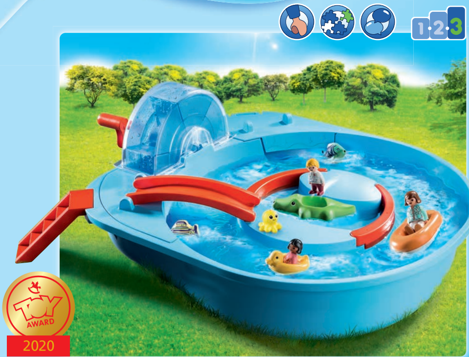
70267 Splish Splash Water Park. Can be filled with water to make accessories float. Use the red