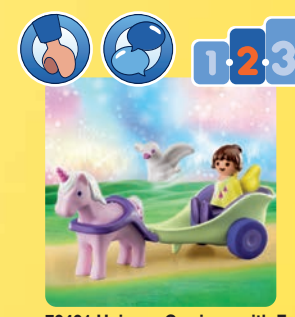
70401 Unicorn Carriage with Fairy. The fairy travels through the fairy forest in the unicorn carriage.