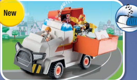
70916 DUCK ON CALL - Ambulance Emergency Vehicle. With lights and sound function and accessible first aid container. Vehicle length: 26 cm / 10.2 in.