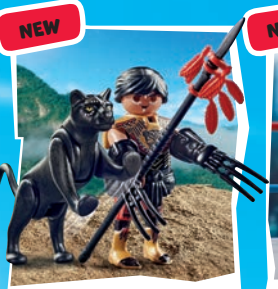
70878 Warrior with Panther