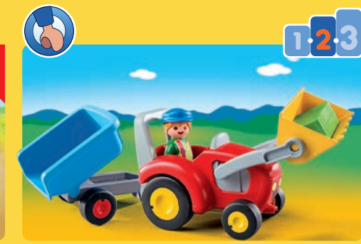
6964 Tractor with Trailer. The bucket and lifting arm are movable. The trailer can be tilted.