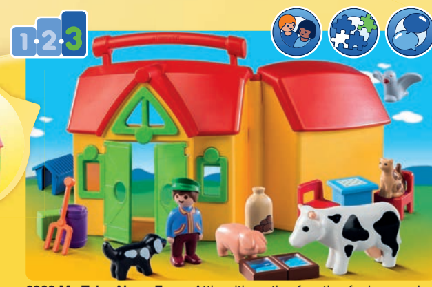
6962 My Take Along Farm. Attic with sorting function for hay, sack and bin. Dimensions when opened 35 x 11 x 19 cm / 13.8 x 4.3 x 7.5 in (LxWxH)