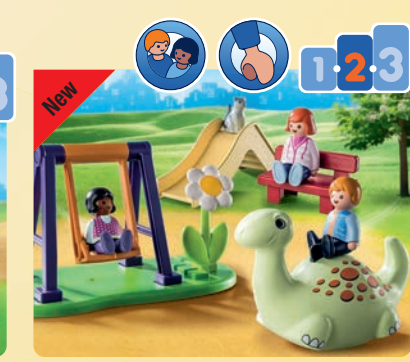
71157 Playground with swing, slide and