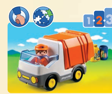
6774 Recycling Truck with sorting function.