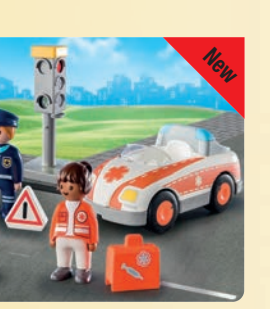
71156 Everyday Heroes. Includes a fire engine with driving sounds, an adjustable traffic light, and an emergency ambulance.