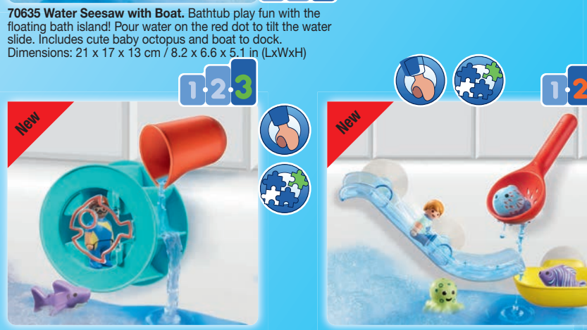
70637 Water Slide with Sea Animals. The cute little sea 70636 Water Wheel with Baby Shark. Fun ride with creatures slide merrily into the water. What great fun to catch them again and fish them out of the water! Includes slide, catch tray and landing net, as well as baby shark, baby octopus and puffer fish. Water Slide Dimensions: 13 x 8 x 9 cm / 5.1 x 3.1 x 3.5 in (LxWxH) the water wheel! Make the wheel move by pouring water from the water cup and watch as the diver and baby shark whirl around. Water Wheel Dimensions: 13 x 13 x 9 cm / 5.1 x 5.1 x 3.5 in (LxWxH)