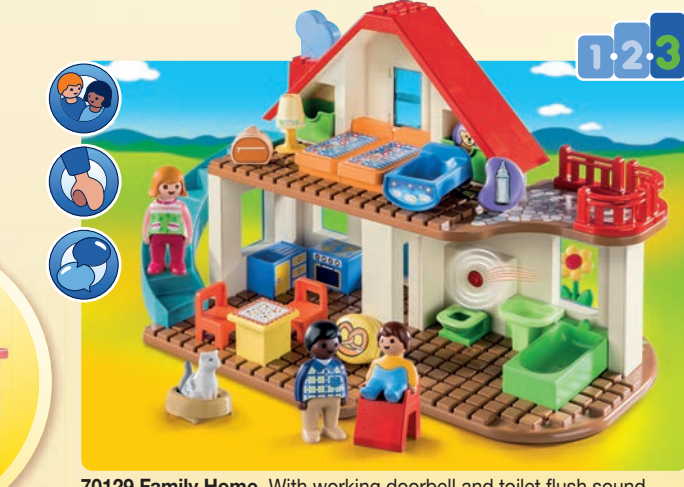
70129 Family Home. With working doorbell and toilet flush sound function. Dimensions 42 \times 26 \times 28 cm / 16.5 \times 10.2 \times 11 in (LxWxH). 2 x AAA batteries required.