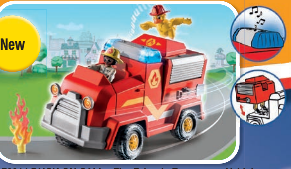
70914 DUCK ON CALL - Fire Brigade Emergency Vehicle. With lights and sound function and projectiles. Vehicle length: 24 cm / 9 in.