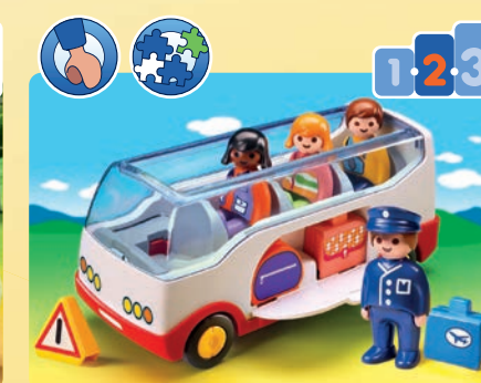
6773 Airport Shuttle Bus