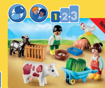
71158 Fun on the Farm with many farm animals and accessories to feed them.