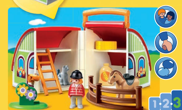
70180 My Take Along Barn. Opens up to reveal storage space for contents of the playset.