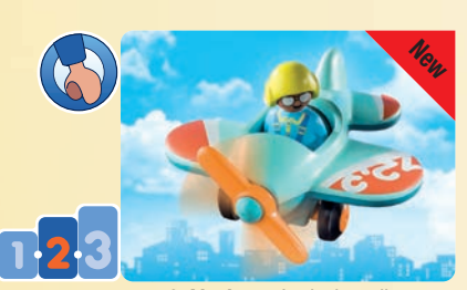
71159 Airplane. Includes pilot.