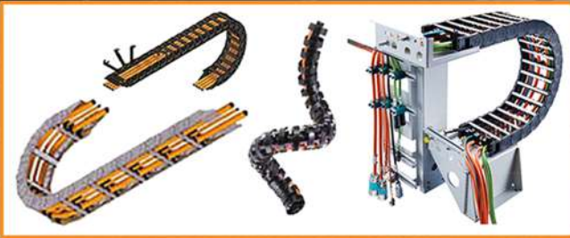
CABLE & HOSE CARRIERS