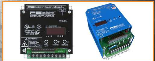
VARIABLE SPEED DRIVES