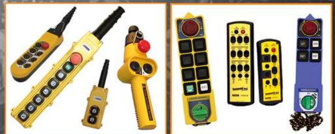
PENDANT & RADIO CONTROLS

Industrial Power & Control, Inc. 5-375 Sheldon Drive Cambridge, ON N1T 1B1 Canada