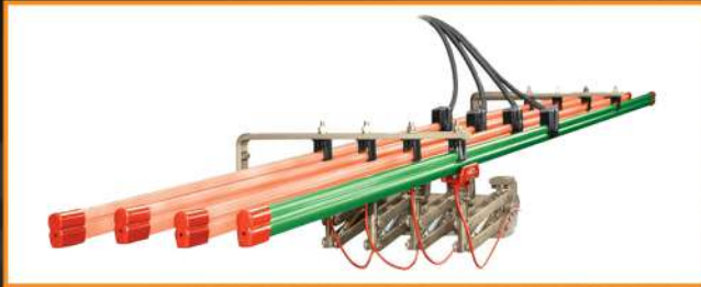
CONDUCTOR BAR SYSTEMS

ENERGY SOLUTIONS FOR CRANES, HOISTS & MONORAILS