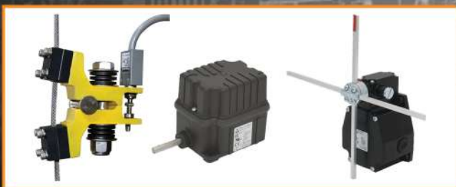
OVERLOAD & POSITION LIMIT SWITCHES