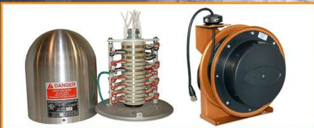
SLIP RINGS & CABLE REELS