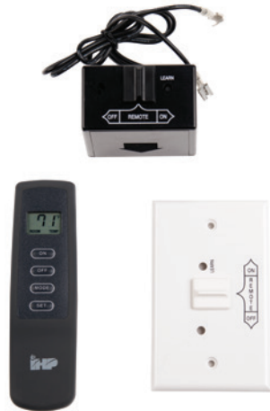
TRC T'stat On/Off Remote Kit