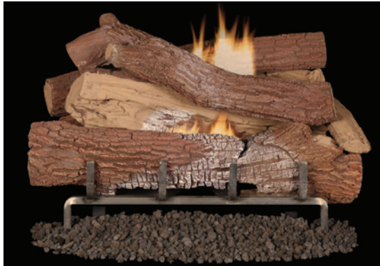
GIANT TIMBERS Outdoor

THE MEGA-FLAME OUTDOOR Series boasts a triple burner to achieve the look of a real wood fire! The burner is cantilevered to produce tall flames that will not be dwarfed by its massive 19" high logs, the tallest in the industry. Outdoor models feature two burners of bright yellow flames, a stainless steel chassis and grate, and an optional lava rock flame bed at its base (for vented applications only).