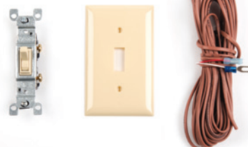
GWMS2 On/Off Wall Switch Kit