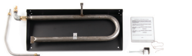
MFEB Volcanic Stone Flame Bed Kit (Mega-Flame Outdoor Series Only)