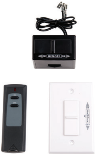
RCKIT 4001 On/Off Remote Receiver Wall Plate Kit