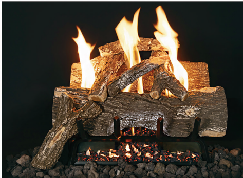
18" Weathered Oak Gas Logs