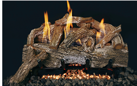
24" Red Oak Gas Logs