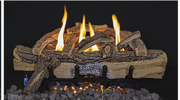
30" Split Oak Gas Logs

All Vent-Free log set styles available in 3 sizes: 18", 24" or 30"