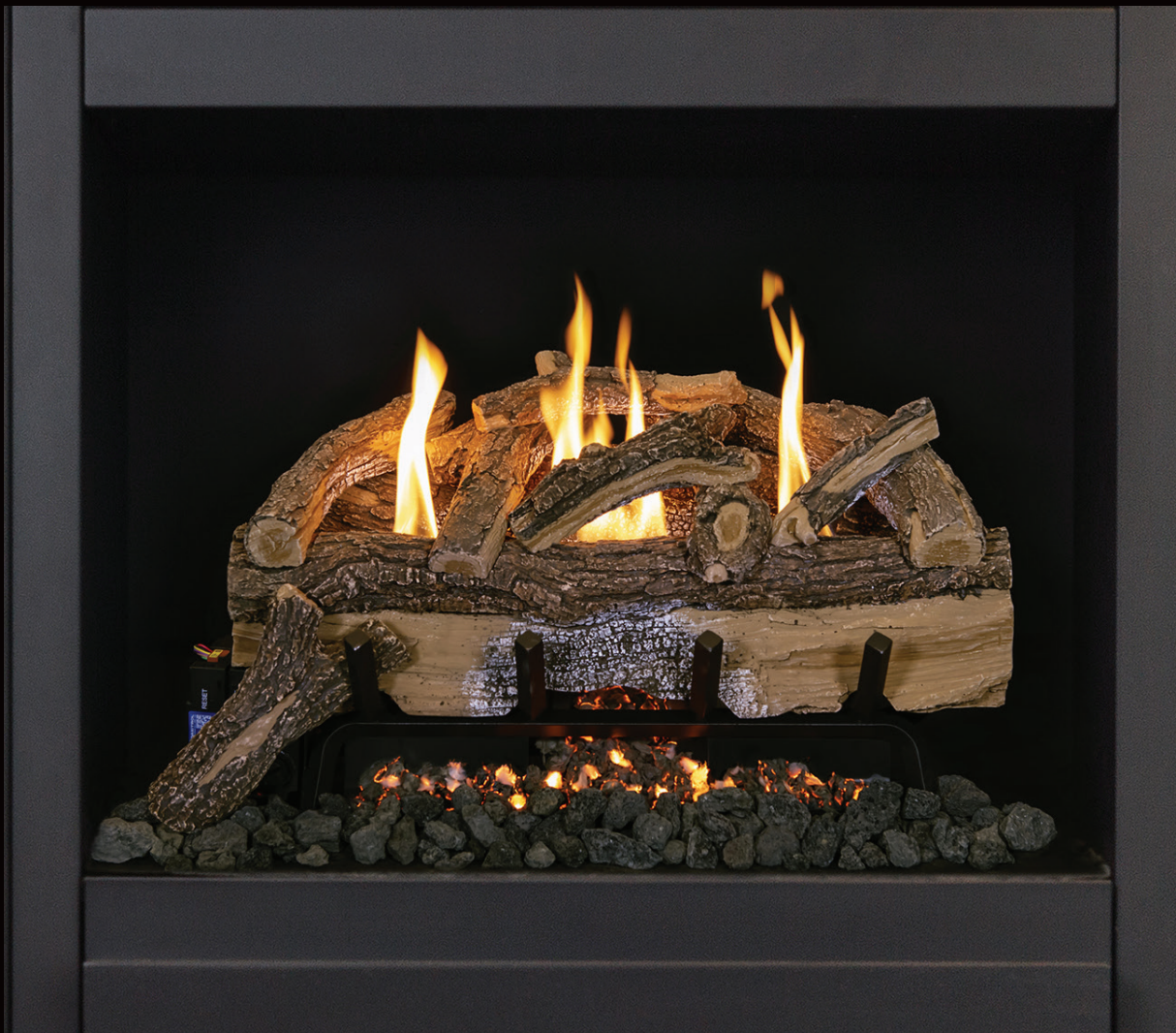
Vent Free Split Oak 24"