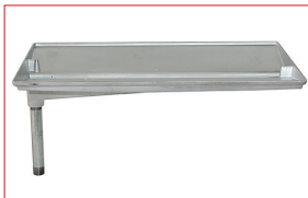
Cast Aluminum Drip Tray Shields food from direct contact with flame reducing flare-ups and providing consistent heat