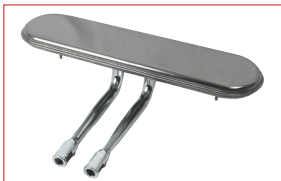
Stainless Steel Dual Burner Provides precise heat and infinite settings