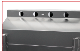
Vents with Damper Slide For added heat retention in cold and/or windy weather