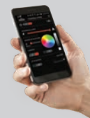
EFIRE ENABLED WITH APP (INCLUDED)