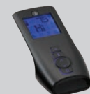
REMOTE CONTROL (INCLUDED)