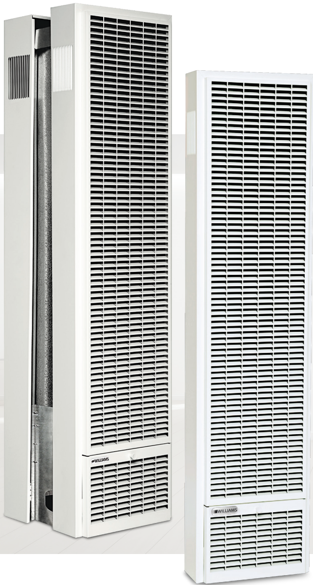
DUAL-WALL TOP-VENT 50,000 BTU/hr.