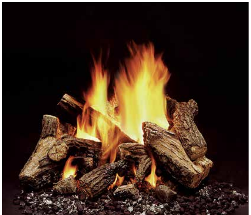
Duzy 5 - 24" Log Set