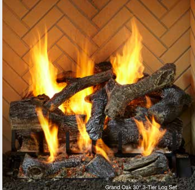
Grand Oak 30" 3-Tier Log Set

You get the look of a traditional, open-hearth fireplace plus the cleanness of gas with touch control. A gas log set doesn't overheat the room or require any change in the appearance or structure of your fireplace. Instead it delivers a realistic, room-enhancing fire at any moment, any day of the year.