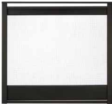
Firescreen Front (Black finish only)