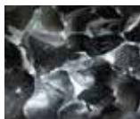
Iced Fog Glass