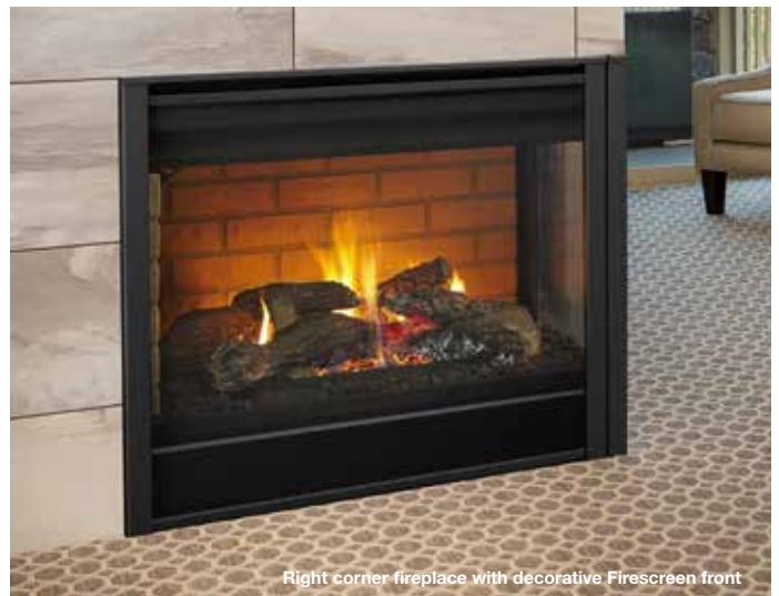
Right corner fireplace with decorative Firescreen front

Corner Fireplaces – Available in right and left corners. Same remote control and fan options available.