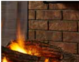
Weathered Traditional Brick

Customize the interior of your fireplace with this alternative style of decorative lining.