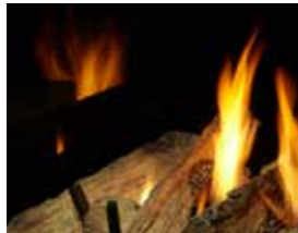
Reflective Black Glass