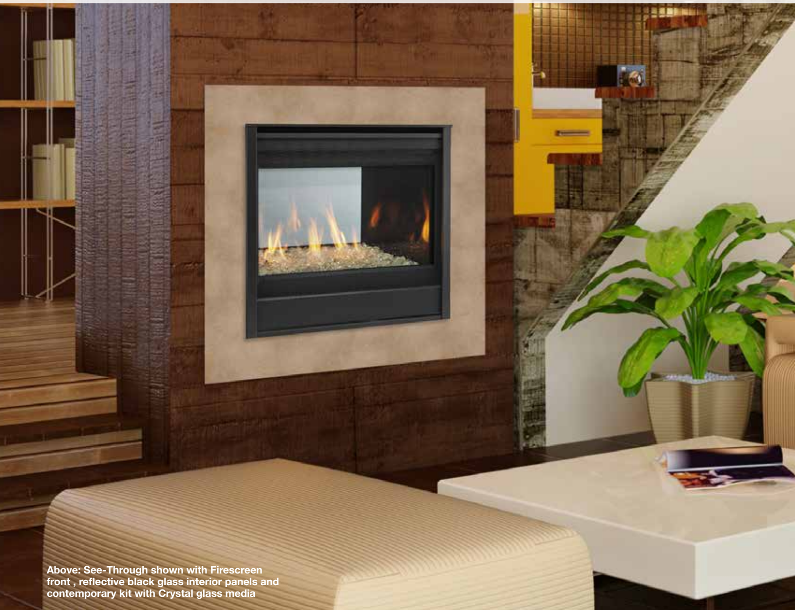
Above: See-Through shown with Firescreen front, reflective black glass interior panels and contemporary kit with Crystal glass media