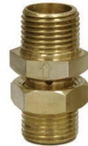
LP Orifice (REMOVE)