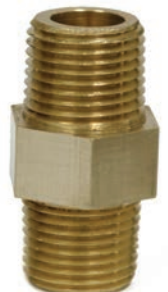
NG Orifice (ADD)