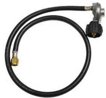
LP Hose and Regulator (REMOVE)

Step 1: Remove the LP AIR MIXER (Shown Above)