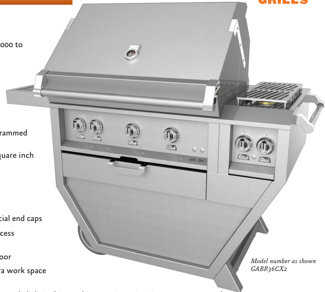
Model number as shown GABR36CX2