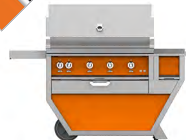
Shown in optional color