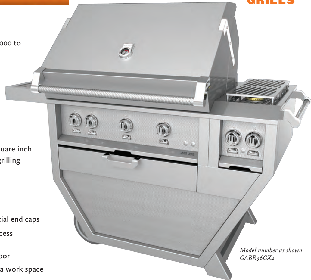
Model number as shown GABR36CX2