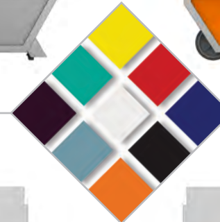
Shown in optional color