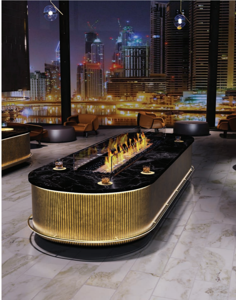
Model: Linear 90