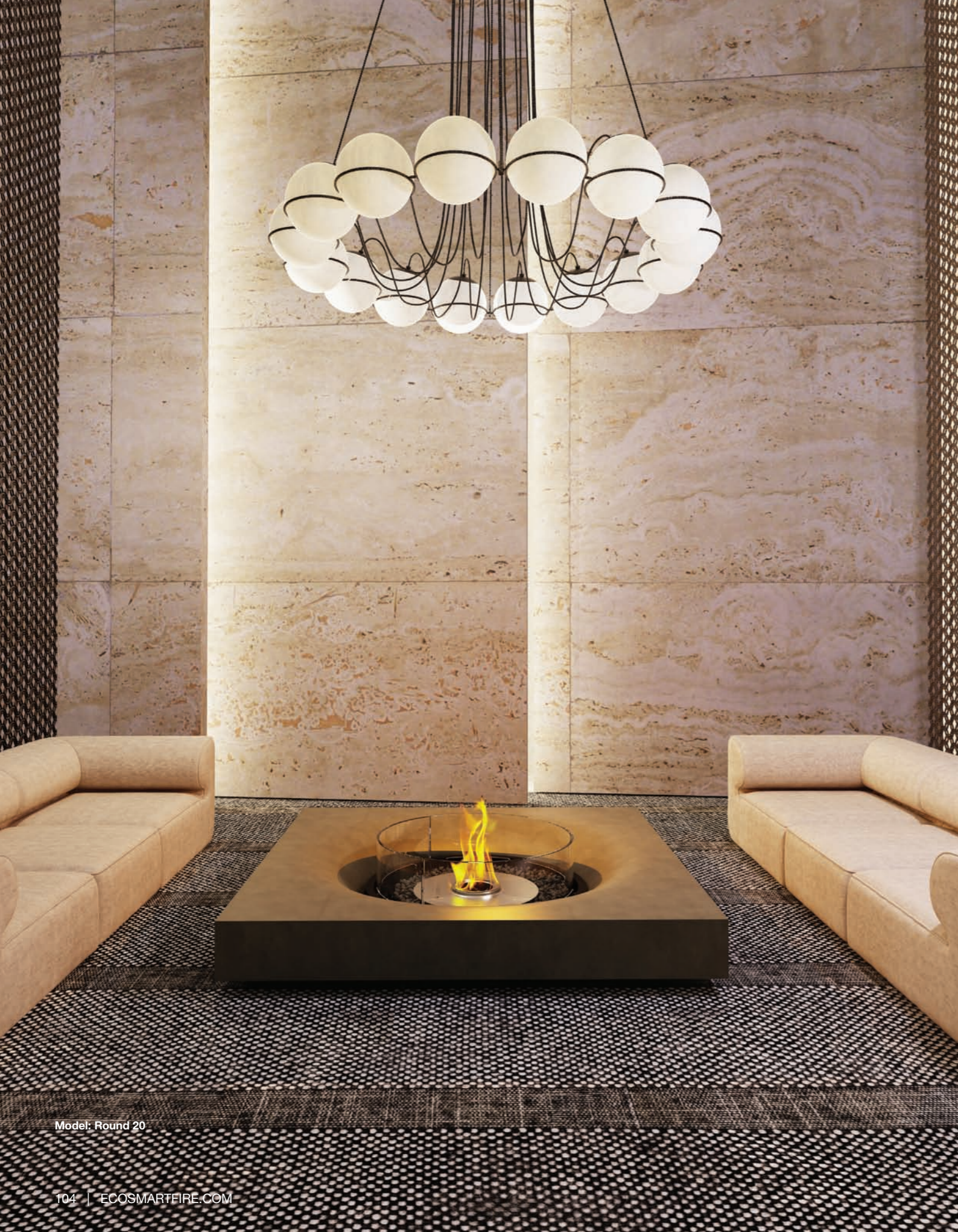
Model: Round 20