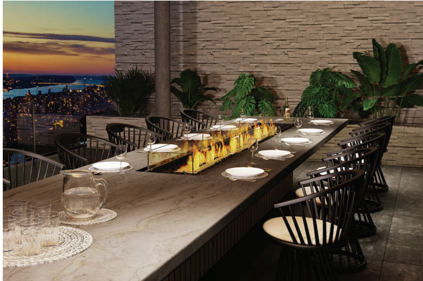
Model: Linear 130