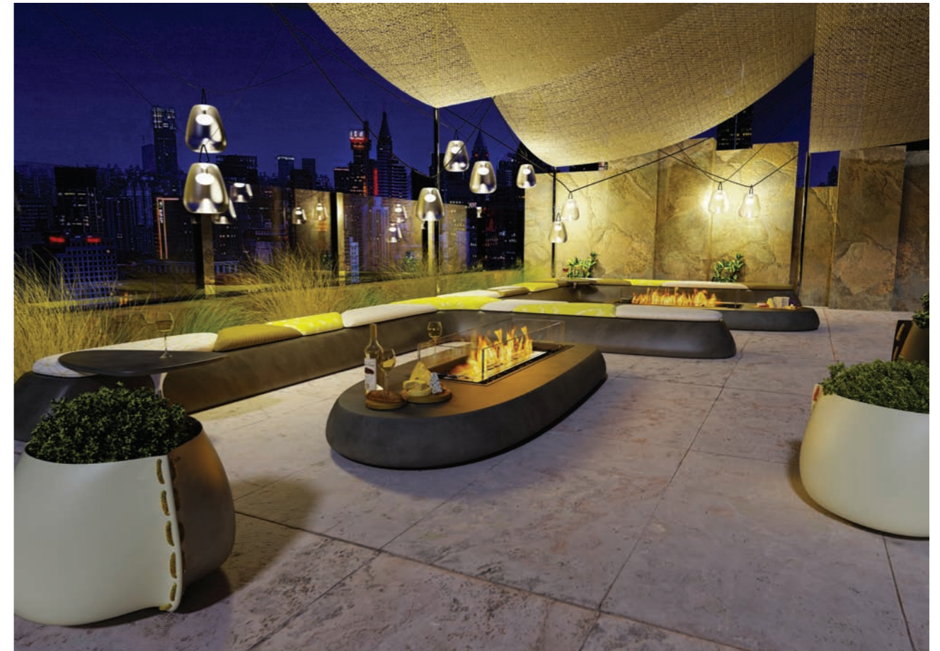
Model: Linear 50