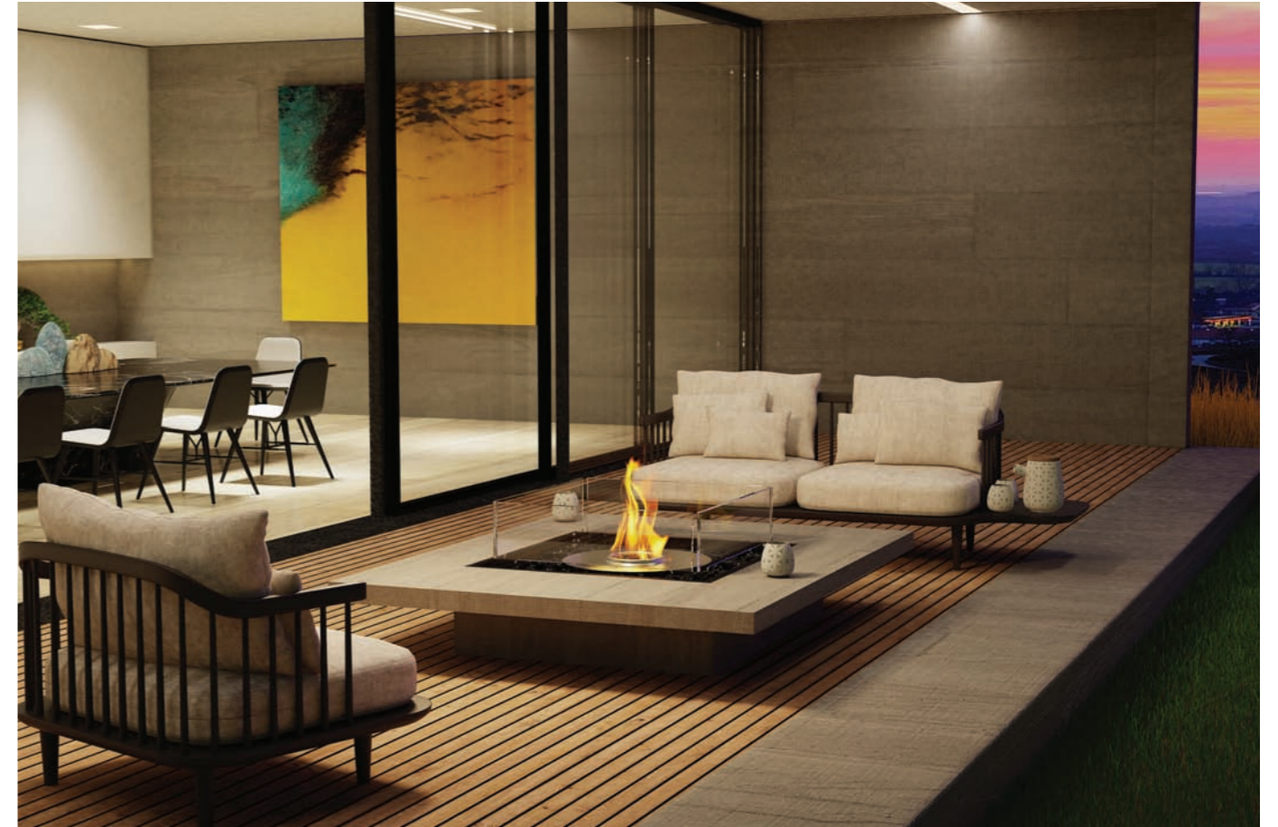
Model: Square 22