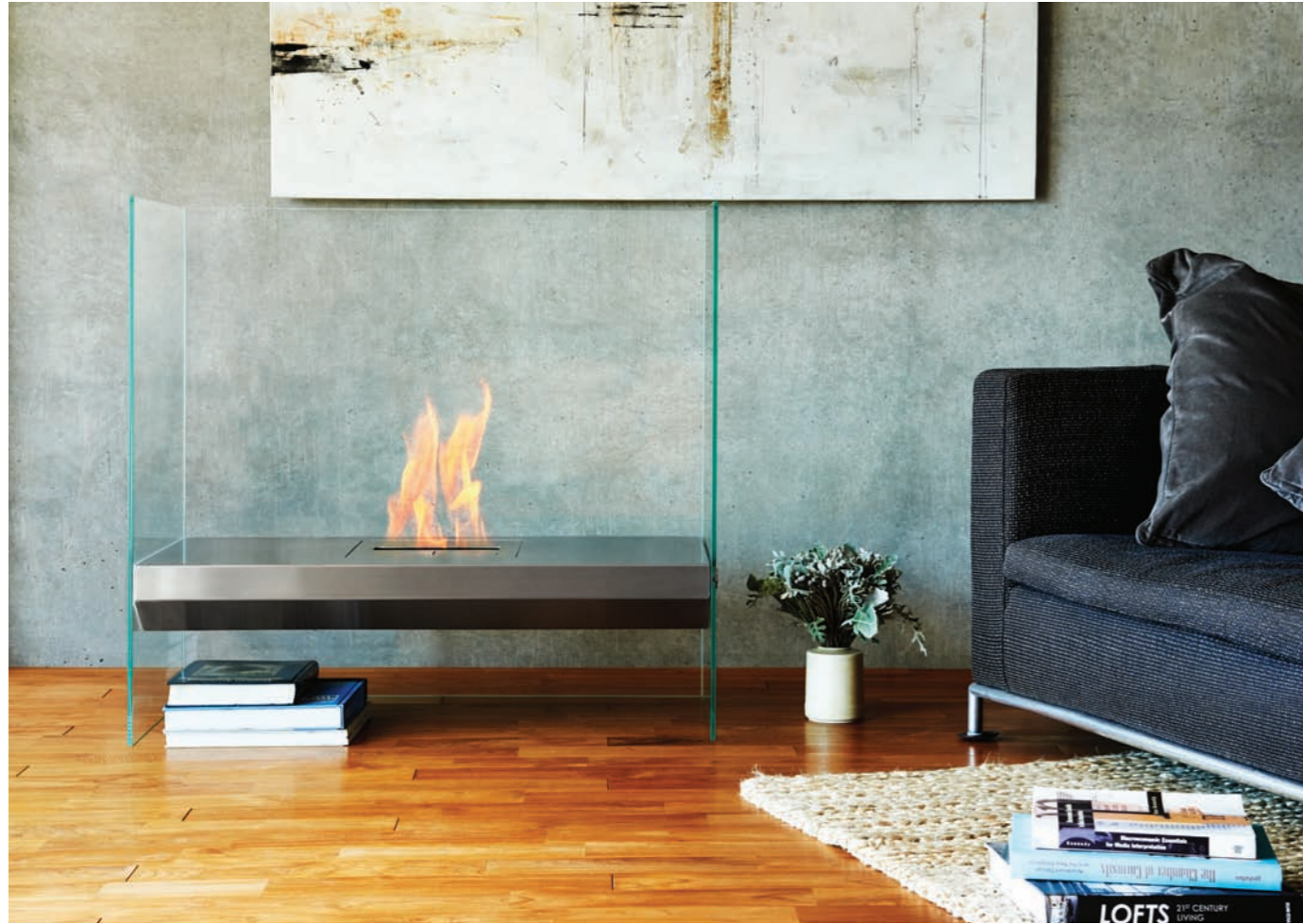
Commercial Space, Japan Model: Igloo