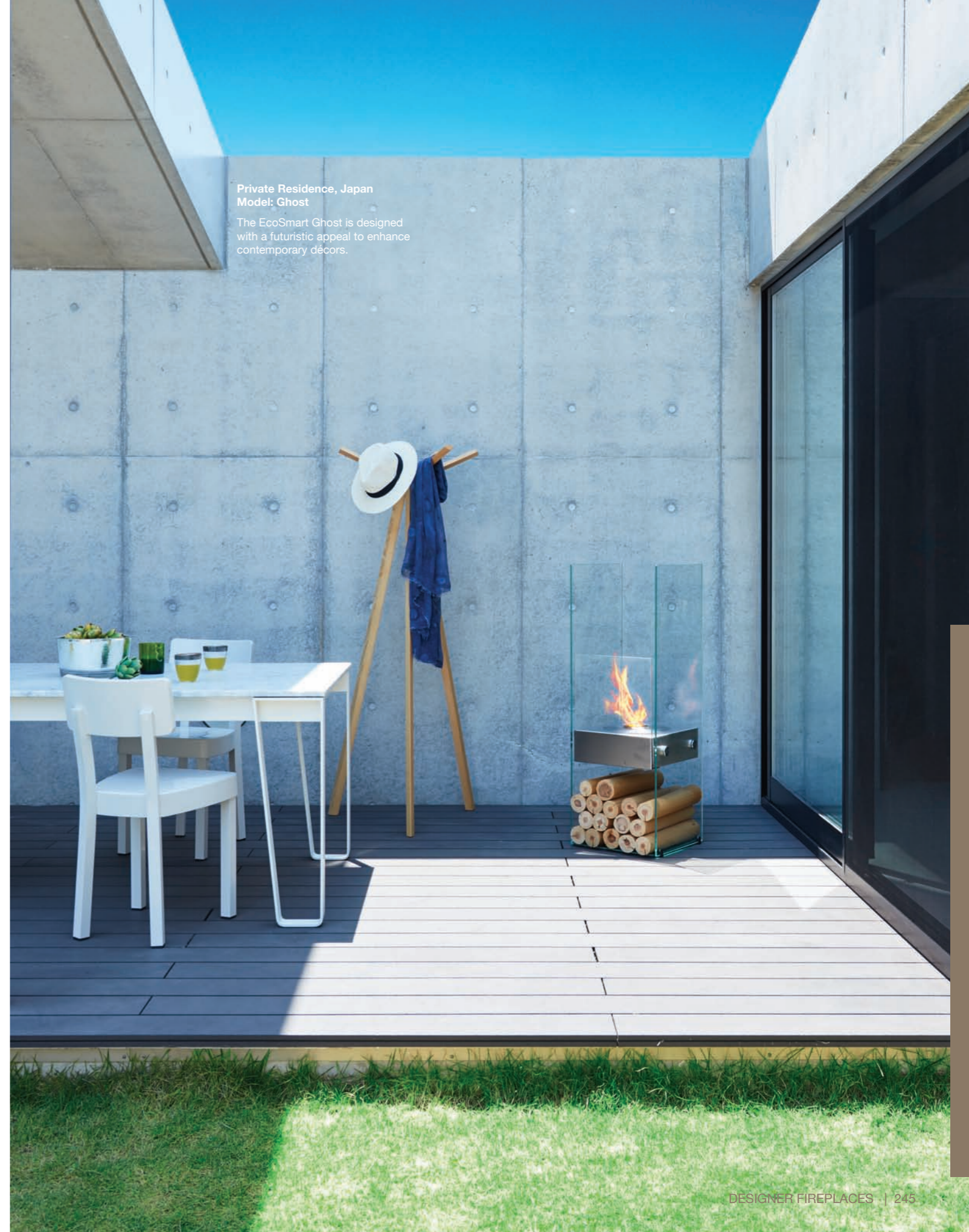
Private Residence, Japan Model: Ghost

The EcoSmart Ghost is designed with a futuristic appeal to enhance contemporary décors.