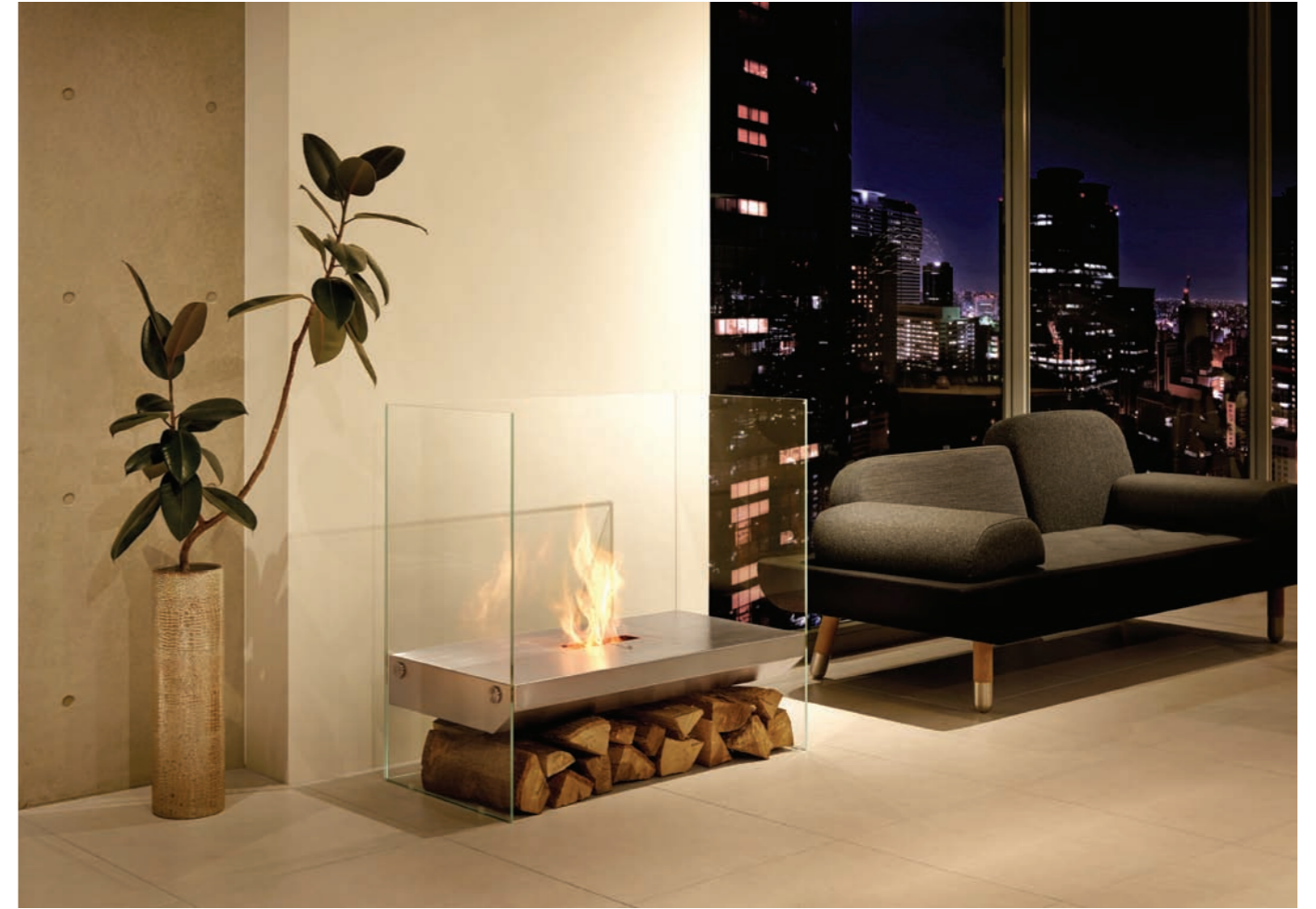
Private Residence, Japan Model: Igloo Taking fire design to new heights. The Igloo works perfectly with this dazzling city skyline.