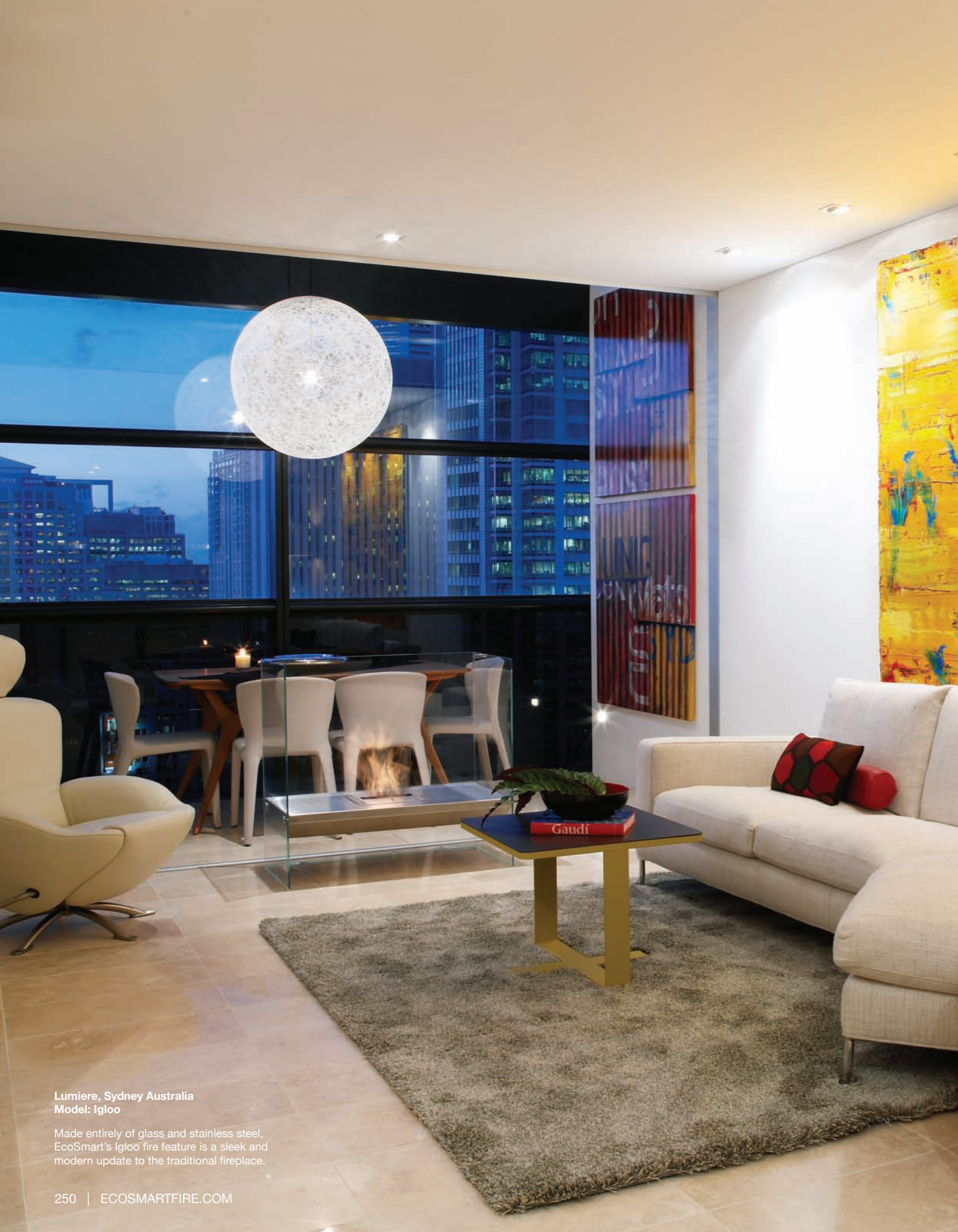
Lumiere, Sydney Australia Model: Igloo

Made entirely of glass and stainless steel, EcoSmart's Igloo fire feature is a sleek and modern update to the traditional fireplace.