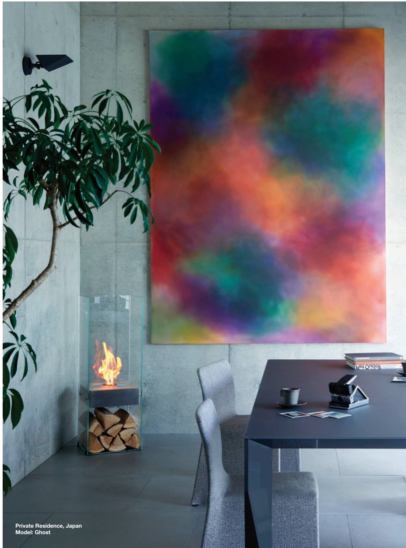
Private Residence, Japan Model: Ghost