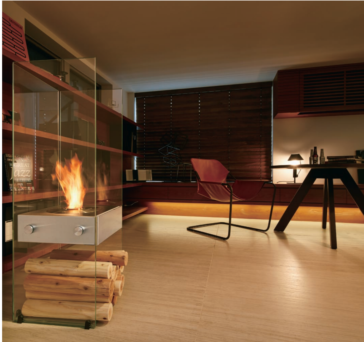
Private Residence, Japan Model: Ghost

No need for cabling, gas connecting, chimneys or flues provides creative freedom for homeowners and interior designers.