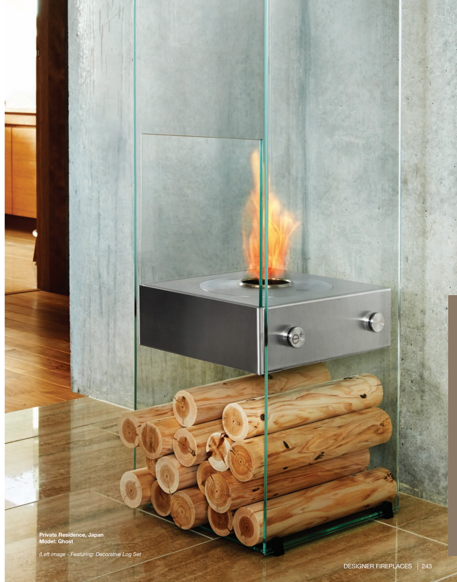
Private Residence, Japan Model: Ghost