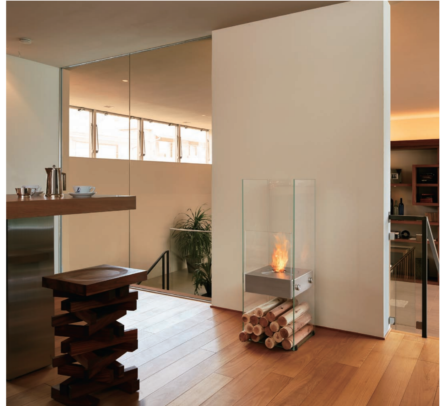
Private Residence, Japan Model: Ghost

No need for cabling, gas connecting, chimneys or flues provides creative freedom for homeowners and interior designers.