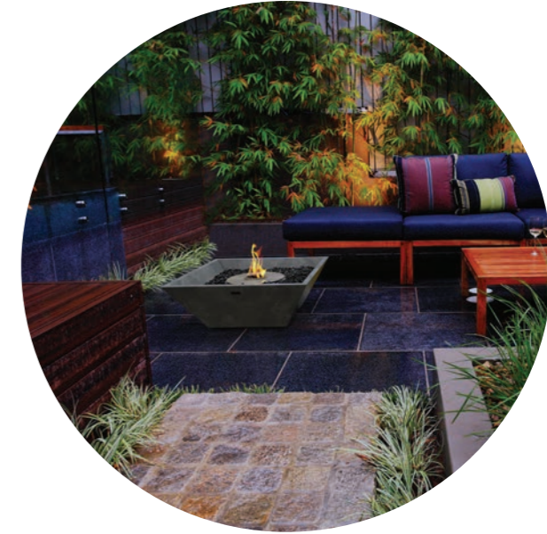
3. Outdoor Space Model: Nova 600

The Nova Series was specially made for the outdoors. A linear twist on a modern classic, the square-shaped, portable Fire Pits are perfect for enjoying under the stars and to beautifully brighten and enhance the ambiance of myriad outdoor spaces.