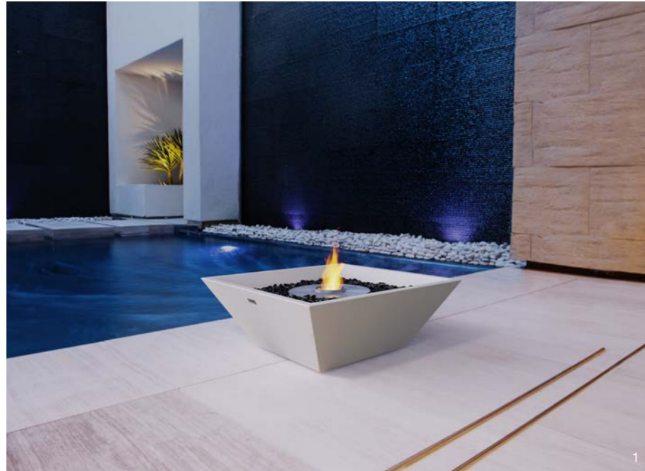
1. Outdoor Space Model: Nova 600