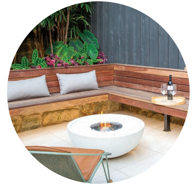
Stone Lotus Landscapes, Australia Transform your home with the warmth and ambiance of a glowing fire.