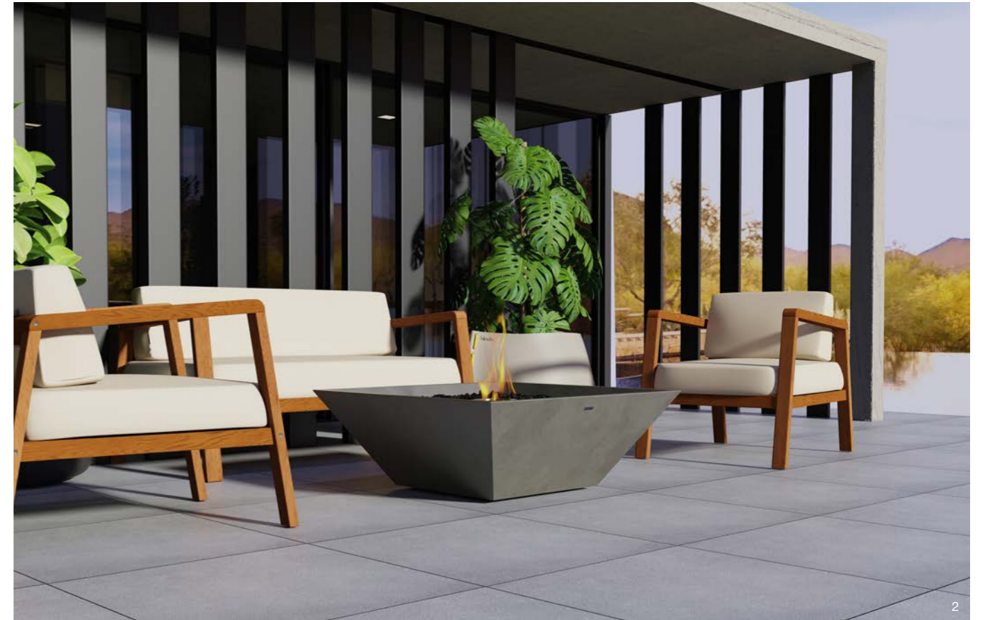
1. Outdoor Space Model: Nova 600