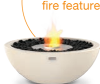
Mix 600 Ø 23.6 H 9.3 (in) (Winter Storage Bag included)