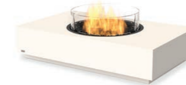
Martini 50 L 50 W 30 H 11.7 (in)