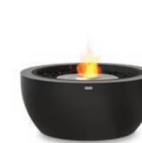
Pod 30 Ø 30 H 13.8 (in)