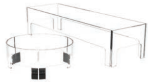
Fire Screen (Select models only)

Our 2021 Collection includes more accessories to easily operate and protect your investment for years to come.