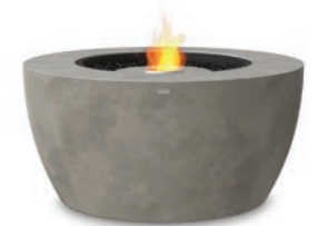
Pod 40 Ø 39.4 H 19.8 (in)