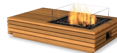
Manhattan 50 L 50 W 30 H 11.7 (in)