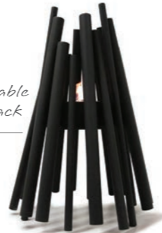
Stix 8 L 31.2 W 31.2 H 42.7 (in) (Outdoor cover available as optional accessory)