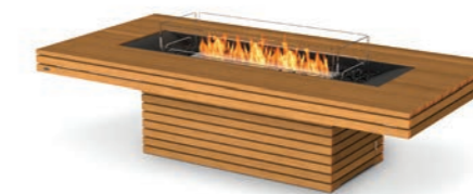
Gin 90 Chat L 89.4 W 43.2 H 23.4 (in)