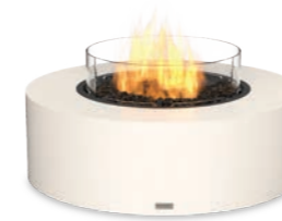
Ark 40 Ø 39.4 H 13.3 (in)

Our classic Fire Pits and multi-functional Fire Tables are available in different shapes and sizes. Select the style that will perfectly complement your space.