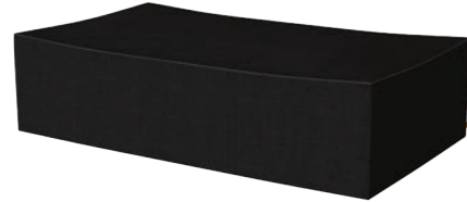
Winter Storage Bag Built with a sturdy waterproof material and waterproof zips and seams to keep your product safe from the elements year-round. (Outdoor models only)