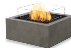
Base 30 L 30.6 W 30.6 H 13.3 (in)