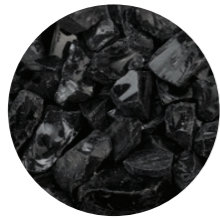
Black Glass Charcoal