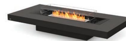
Gin 90 Low L 89.4 W 43.2 H 13.6 (in)