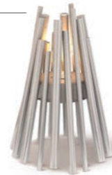
Stix L 21.9 W 21.9 H 30.7 (in) (Outdoor cover available as optional accessory)