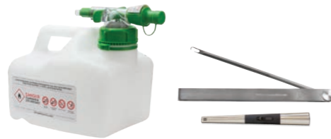
Jerry Can, Lighting Rod and Lighter (Ethanol models only)