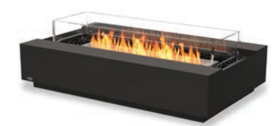
Cosmo 50 L 50 W 30 H 11.7 (in)