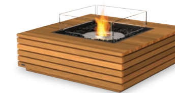
Base 40 L 39.4 W 39.4 H 13.3 (in)