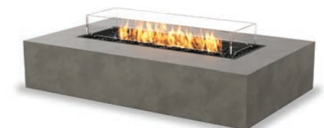
Wharf 65 L 65 W 39.4 H 13.3 (in)