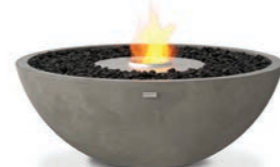
Mix 850 Ø 33.5 H 12.5 (in) (Winter Storage Bag included)