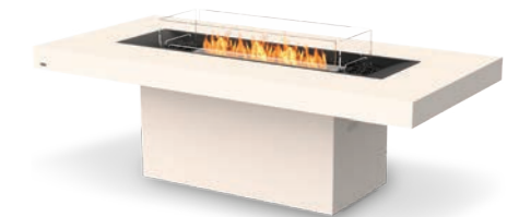
Gin 90 Dining L 89.4 W 43.2 H 29.3 (in)

Explore the complete collection, visit ecosmartfire.com