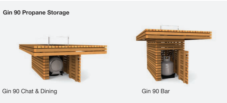
Gin 90 Chat & Dining