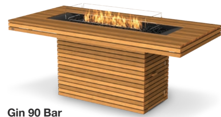
Gin 90 Bar L 89.4 W 43.2 H 41.1 (in)