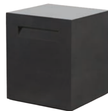
Tank (Cover, Stool/Side Table)