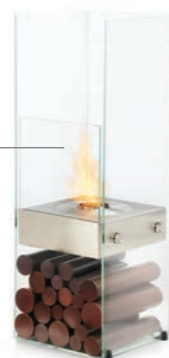
Ghost L 15.2 W 17.7 H 43.5 (in)