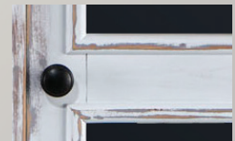
METAL ACCENT DOOR HANDLES