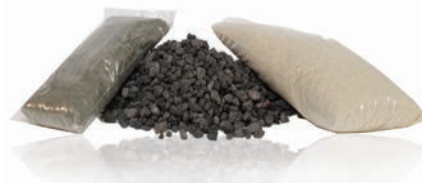
Embers, Rock and Sand (included with all Double and See-Through Burners)