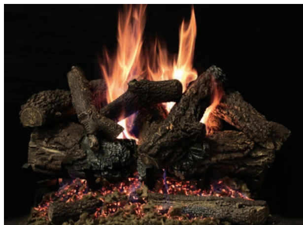
Treehouse 11 (LTH11) Refractory Log Set