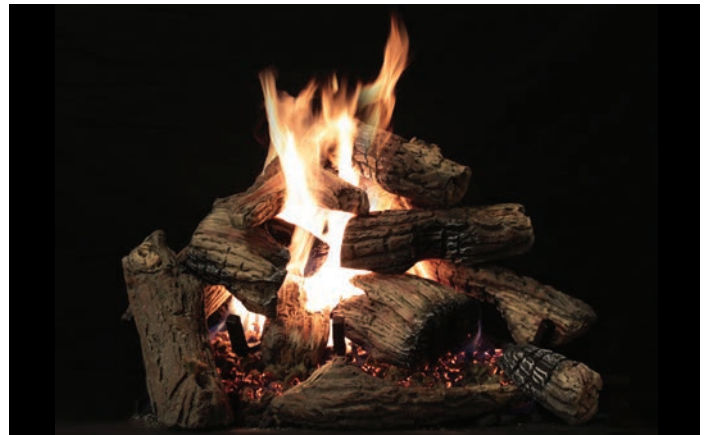
Kensington Forest 18-Inch (LKF) Ceramic Fiber Log Set