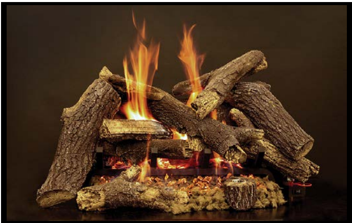
Pioneer 24-Inch (LPR) Refractory Log Set