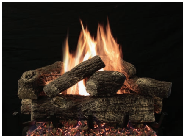
Treehouse 7 (LTH7) Refractory Log Set