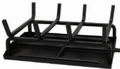
See-Through Burner (B3) (requires See-Through Log Set)

* Accepts Manual and Millivolt Nat and LP accessory Valve Kits ** LP Conversion Kits available