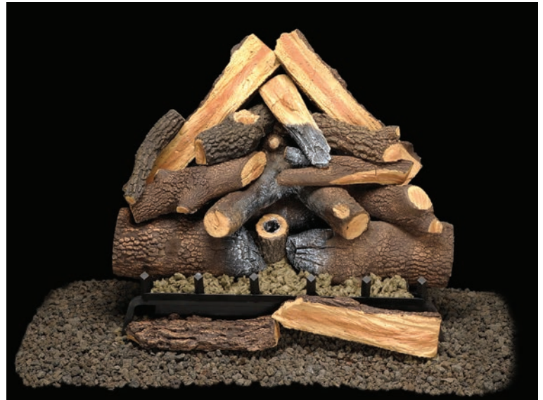
Advantage Refractory Log Set shown with Skyscraper (LAV) Accessory Refractory Logs