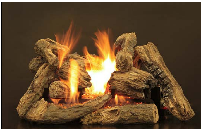
Kensington Forest 24-Inch (LKF) Ceramic Fiber Log Set