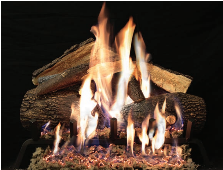
Advantage (LA) Refractory Log Set shown with Triple Burner