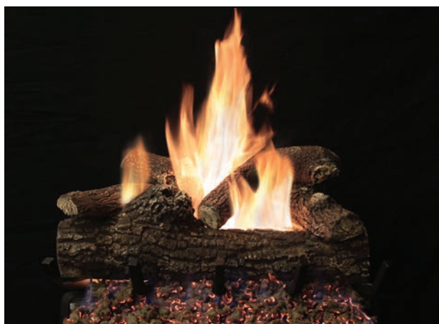
Great Lakes Oak (LGLO) Refractory Log Set