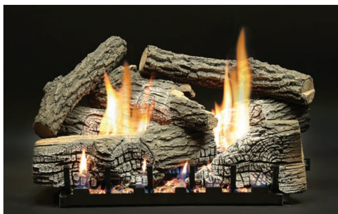
Super Stacked Wildwood Refractory Log Set (LS24WRS)