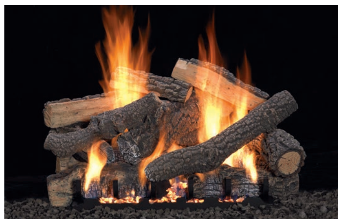
Ponderosa Refractory Log Set (LS24P)