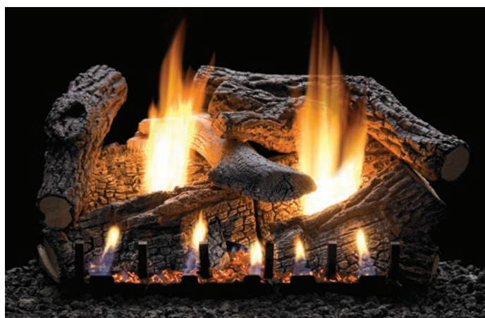
Super Sassafras Refractory Log Set (LS24RSS)