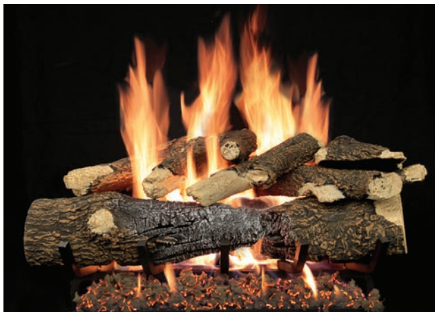
Frontier (LFR) Refractory Log Set