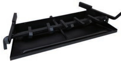
Double Burner (BX)

* Accepts Manual and Millivolt Nat and LP accessory Valve Kits ** LP Conversion Kits available