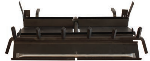
Triple Burner (AV)