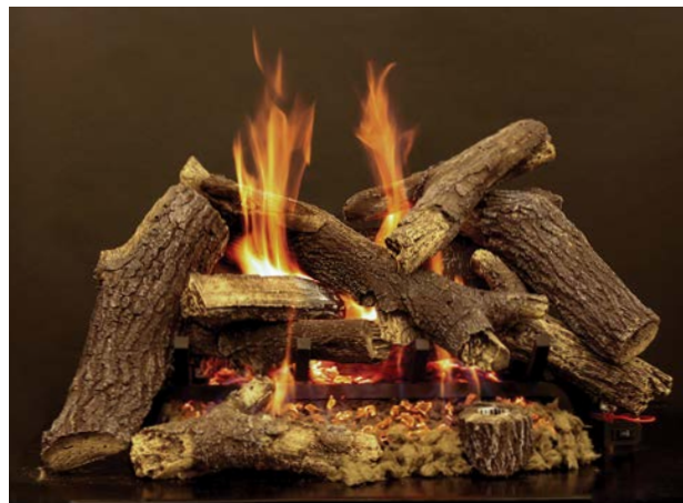
Pioneer (LPR) Refractory Log Set