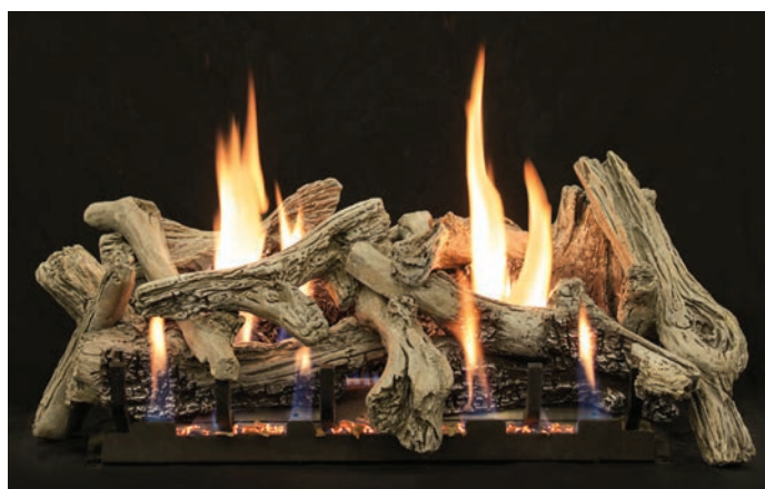
Driftwood Burncrete® Log Set (LS24CD)