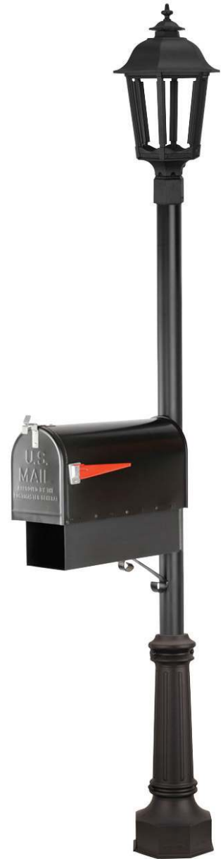
Shown combined with lamp