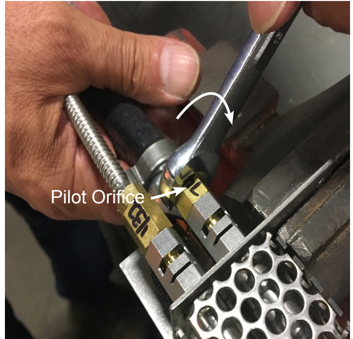
Fig. 2 Shows 1/2" wrench removing the pilot orifice.

STEP 4: Install the new LP pilot orifice (labeled "76") in place of the Natural gas orifice just removed and secure into place.