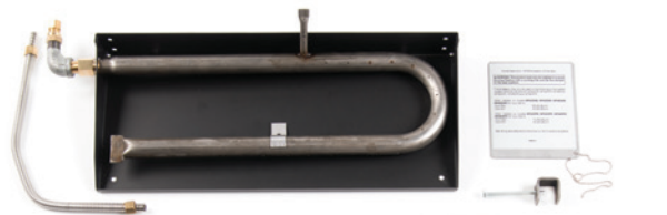
MFEB Volcanic Stone Flame Bed Kit (Mega-Flame Outdoor Series Only)