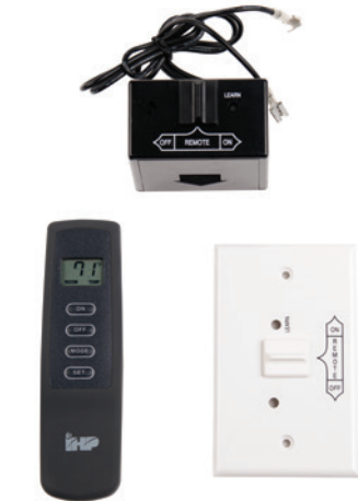
TRC T'stat On/Off Remote Kit