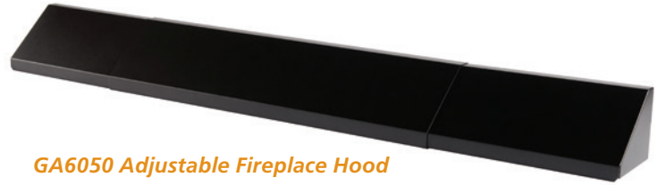
GA6050 Adjustable Fireplace Hood