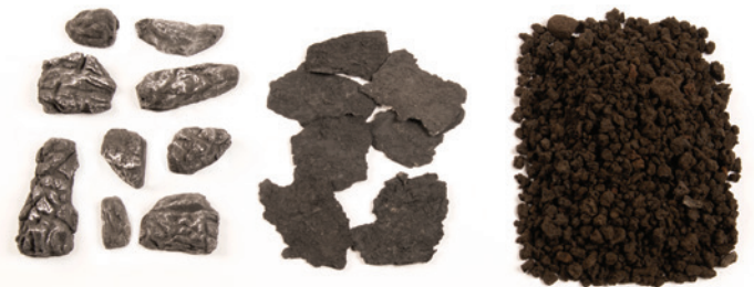
FM100 Floor Media Kit (3 media types) or Separate FDVS Volcanic Stone