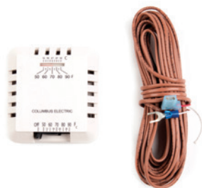
GWMT1 Wall Mount T'stat Control Kit