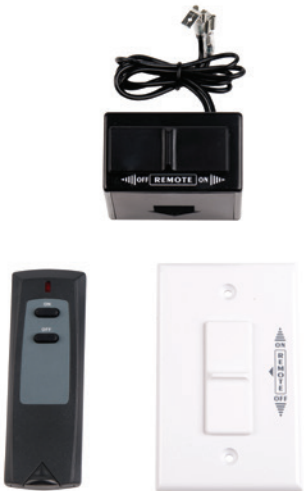
RCKIT 4001 On/Off Remote Receiver Wall Plate Kit