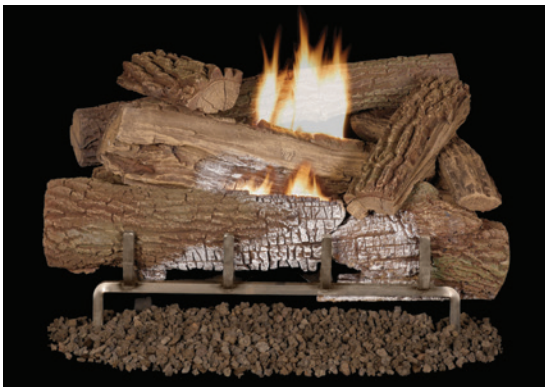
MOSSY OAK Outdoor