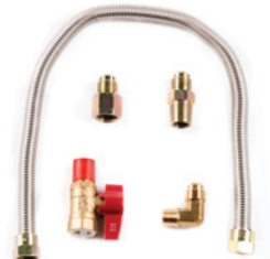
CIKA Gas Appliance Installation Kit