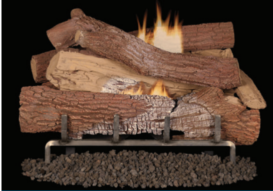
GIANT TIMBERS Outdoor

THE MEGA-FLAME OUTDOOR Series boasts a triple burner to achieve the look of a real wood fire! The burner is cantilevered to produce tall flames that will not be dwarfed by its massive 19" high logs, the tallest in the industry. Outdoor models feature two burners of bright yellow flames, a stainless steel chassis and grate, and an optional lava rock flame bed at its base (for vented applications only).