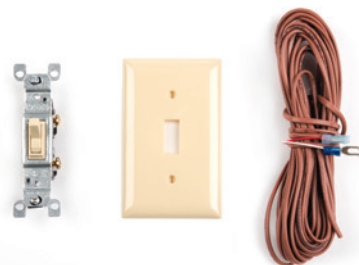
GWMS2 On/Off Wall Switch Kit