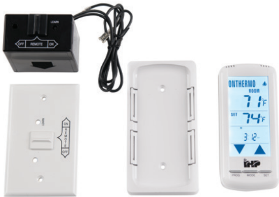
TSRC Receiver Touch Screen Remote Kit