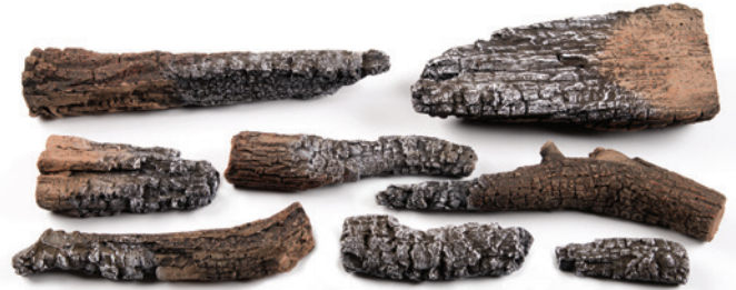
LAMF-Decorative Log Accessory Kit (Giant Timbers)