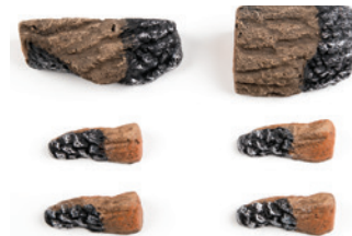
CDABKA Decorative Ash Bed/Control Cover Kit