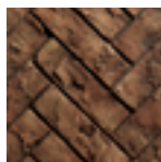
Herringbone Brick Liner RLH

Model ZVF24 Vent-Free Firebox with ZVFB2426MVN Vent-Free Burner System (Natural Gas) LOGF10 Log Set, ZVF24RLT Brick Liner (Traditional), ZVF24SDBL Surround Deluxe (Black), ZVF24ADDD Arch Door, Double Door.