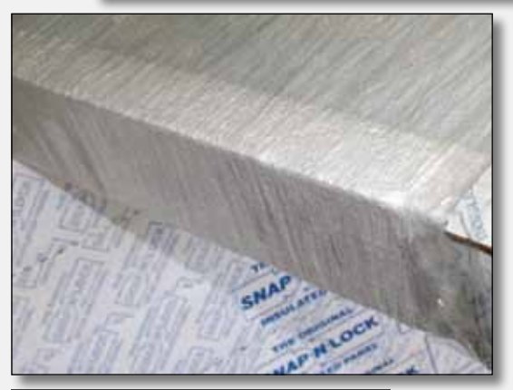
Foam bumpers are used on both the male and female sides of the panels to prevent accidental denting and scratching.

If you order a stock panel, the size you request will be scanned in the warehouse reserving it for your delivery. The system will only allow the correct panels for your order to be scanned.