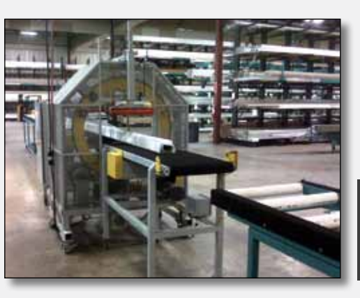
Industrial wrapping machines and heavy cardboard endcaps protect your panels from damage.

Shipping labels unique to each individual panel are printed and applied to the end caps. The labels show panel and customer information. This enables us to locate the panels that were made specifically for your project when preparing to load the truck for delivery.