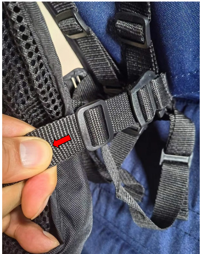
Step 6 Tighten the strap on both side.