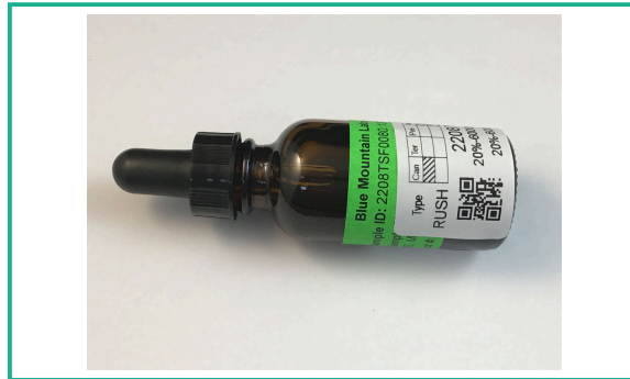
The photo on this report is of a sample collected by the lab and may vary from the final packaging

Test performed via Hardy chromogenic dry and agar plates. ND = Non Detect; LOQ = Limit of Quantitation; Tested Microbial Endpoints: Total Viable Aerobic Bacteria, Total Yeast and Mold, Total Coliforms, Enterobacteriaceae, Aspergillus (flavus, fumigatus, niger and terreus), E.coli pathogenic strains, and Salmonella spp. Microbial testing performed per SOP-000004 Method. LOQ has been set to the Limit of Detection (LOD) / Method Detection Limit (MDL) for all endpoints.