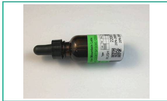
The photo on this report is of a sample collected by the lab and may vary from the final packaging

Test performed via Hardy chromogenic dry and agar plates. ND = Non Detect; LOQ = Limit of Quantitation; Tested Microbial Endpoints: Total Viable Aerobic Bacteria, Total Yeast and Mold, Total Coliforms, Enterobacteriaceae, Aspergillus (flavus, fumigatus, niger and terreus), E.coli pathogenic strains, and Salmonella spp. Microbial testing performed per SOP-000004 Method. LOQ has been set to the Limit of Detection (LOD) / Method Detection Limit (MDL) for all endpoints.