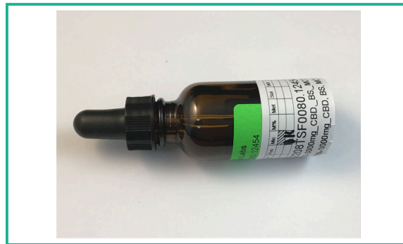
The photo on this report is of a sample collected by the lab and may vary from the final packaging

Test performed via Hardy chromogenic dry and agar plates. ND = Non Detect; LOQ = Limit of Quantitation; Tested Microbial Endpoints: Total Viable Aerobic Bacteria, Total Yeast and Mold, Total Coliforms, Enterobacteriaceae, Aspergillus (flavus, fumigatus, niger and terreus), E.coli pathogenic strains, and Salmonella spp. Microbial testing performed per SOP-000004 Method. LOQ has been set to the Limit of Detection (LOD) / Method Detection Limit (MDL) for all endpoints.