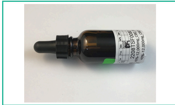
The photo on this report is of a sample collected by the lab and may vary from the final packaging

Test performed via Hardy chromogenic dry and agar plates. ND = Non Detect; LOQ = Limit of Quantitation; Tested Microbial Endpoints: Total Viable Aerobic Bacteria, Total Yeast and Mold, Total Coliforms, Enterobacteriaceae, Aspergillus (flavus, fumigatus, niger and terreus), E.coli pathogenic strains, and Salmonella spp. Microbial testing performed per SOP-000004 Method. LOQ has been set to the Limit of Detection (LOD) / Method Detection Limit (MDL) for all endpoints.