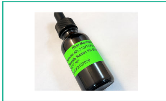
The photo on this report is of a sample collected by the lab and may vary from the final packaging

Test performed via Hardy chromogenic dry and agar plates. ND = Non Detect; LOQ = Limit of Quantitation; Tested Microbial Endpoints: Total Viable Aerobic Bacteria, Total Yeast and Mold, Total Coliforms, Enterobacteriaceae, Aspergillus (flavus, fumigatus, niger and terreus), E.coli pathogenic strains, and Salmonella spp. Microbial testing performed per SOP-000004 Method. LOQ has been set to the Limit of Detection (LOD) / Method Detection Limit (MDL) for all endpoints.