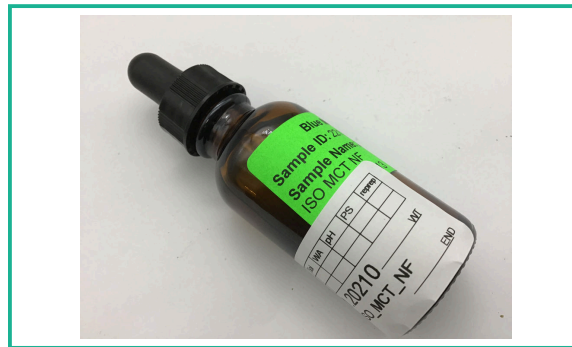
The photo on this report is of a sample collected by the lab and may vary from the final packaging

Test performed via Hardy chromogenic dry and agar plates. ND = Non Detect; LOQ = Limit of Quantitation; Tested Microbial Endpoints: Total Viable Aerobic Bacteria, Total Yeast and Mold, Total Coliforms, Enterobacteriaceae, Aspergillus (flavus, fumigatus, niger and terreus), E.coli pathogenic strains, and Salmonella spp. Microbial testing performed per SOP-000004 Method. LOQ has been set to the Limit of Detection (LOD) / Method Detection Limit (MDL) for all endpoints.