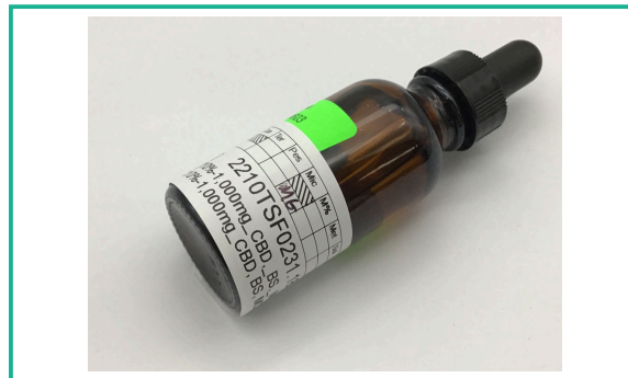
The photo on this report is of a sample collected by the lab and may vary from the final packaging

Test performed via Hardy chromogenic dry and agar plates. ND = Non Detect; LOQ = Limit of Quantitation; Tested Microbial Endpoints: Total Viable Aerobic Bacteria, Total Yeast and Mold, Total Coliforms, Enterobacteriaceae, Aspergillus (flavus, fumigatus, niger and terreus), E.coli pathogenic strains, and Salmonella spp. Microbial testing performed per SOP-000004 Method. LOQ has been set to the Limit of Detection (LOD) / Method Detection Limit (MDL) for all endpoints.