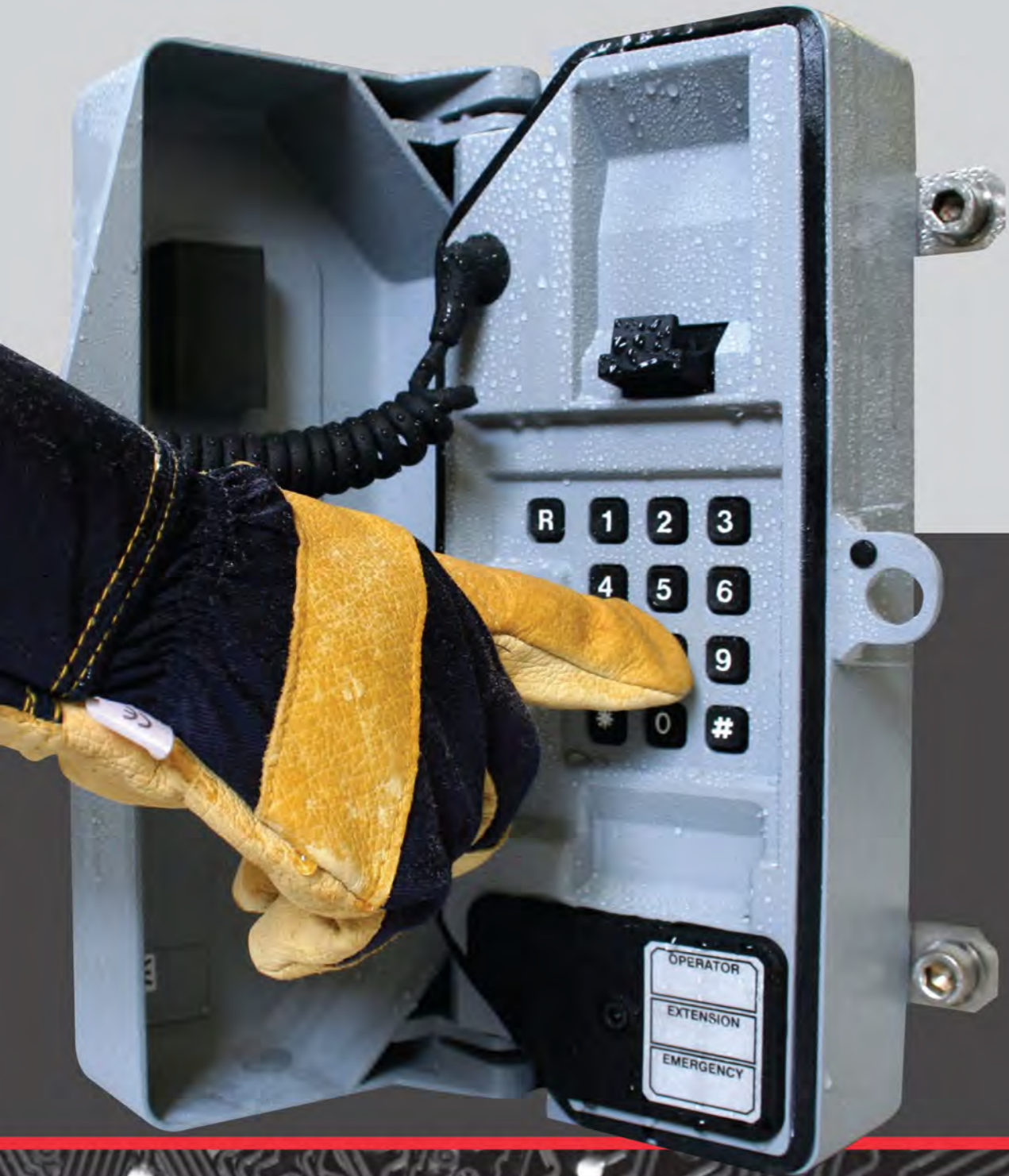
Vandal and Weather Resistant Telephones

We strive for excellence in all aspects of our work, particularly in terms of reliability, honesty and integrity. We maintain high standards with innovative product design and investment in research and development. In recognition of the quality of our products and the way in which we deliver our services, we have been awarded a number of accreditations and qualifications including ISO 9001 , Link-Up - the UK rail industry supplier qualification scheme, and Network Rail Product Acceptance .