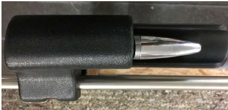
Figure 8 - Ring temple with cover