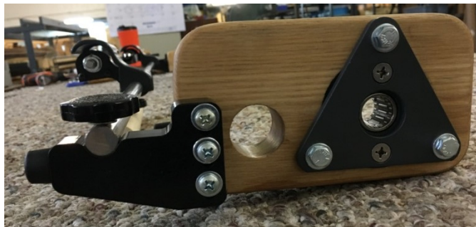
Figure 2 – Ring temple holder, left