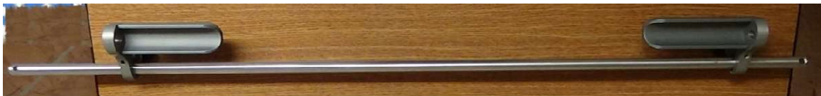
Figure 4 – Ring temple supports on rod