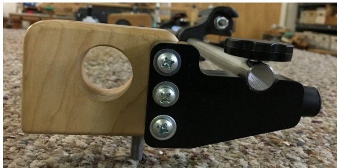
Figure 1 – Ring temple holder, right

Pay close attention to the width and depth of the holes given on the template.