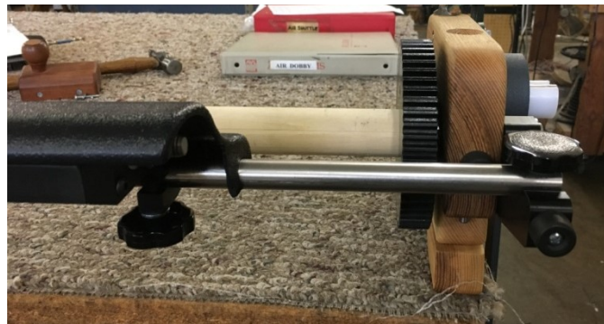
Figure 5 – Ring temple rod attached to holder