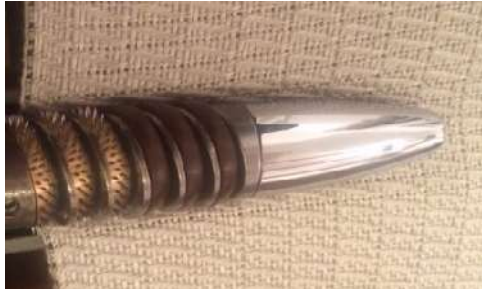
Figure 6 - Ring Temple on Fabric