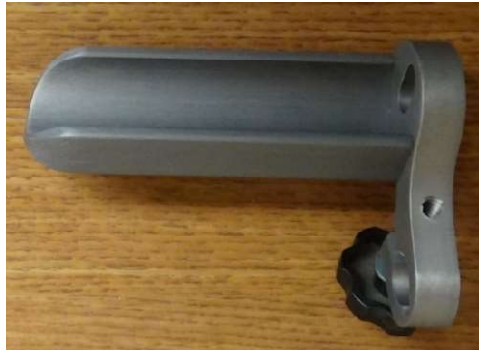
Figure 3 – Ring temple support with knob