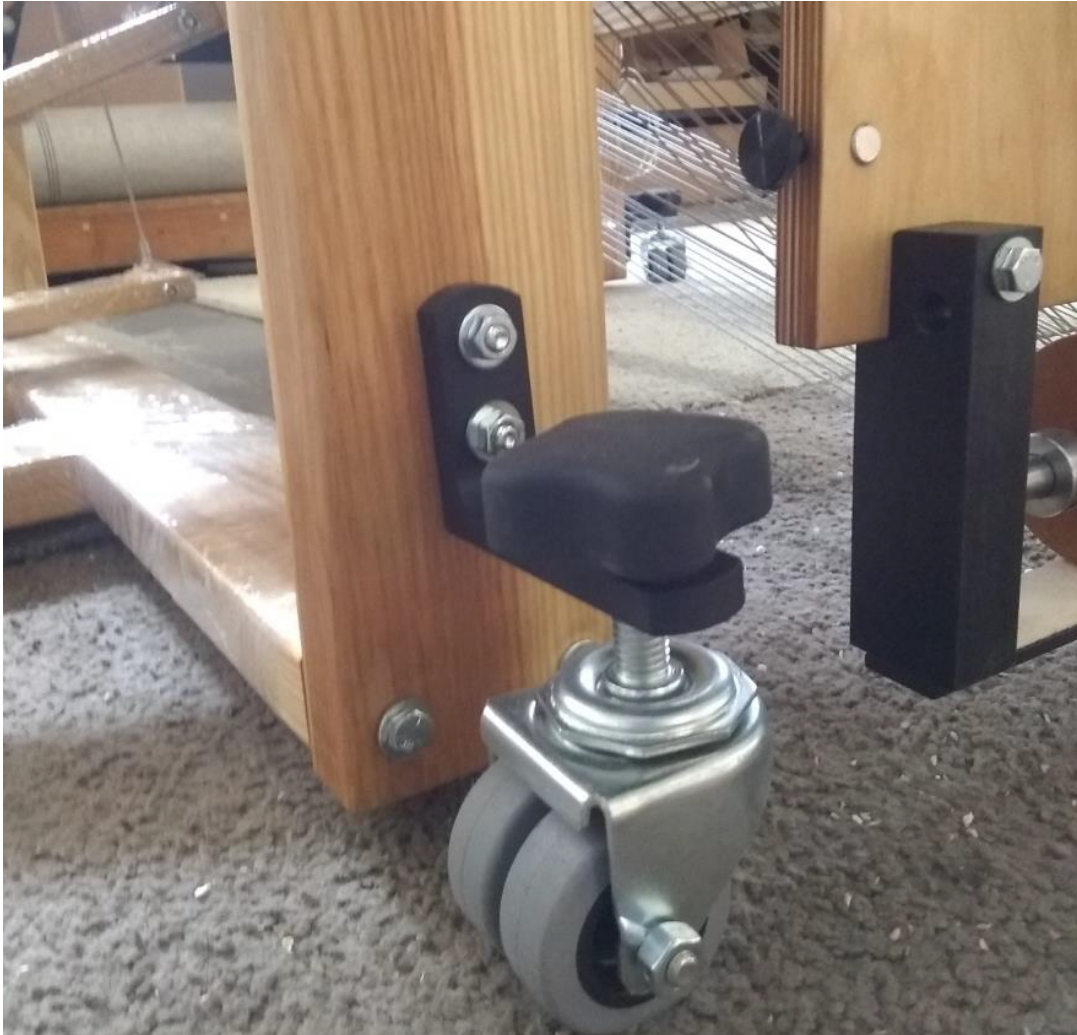
Figure 3 - Caster attached to front leg of the loom