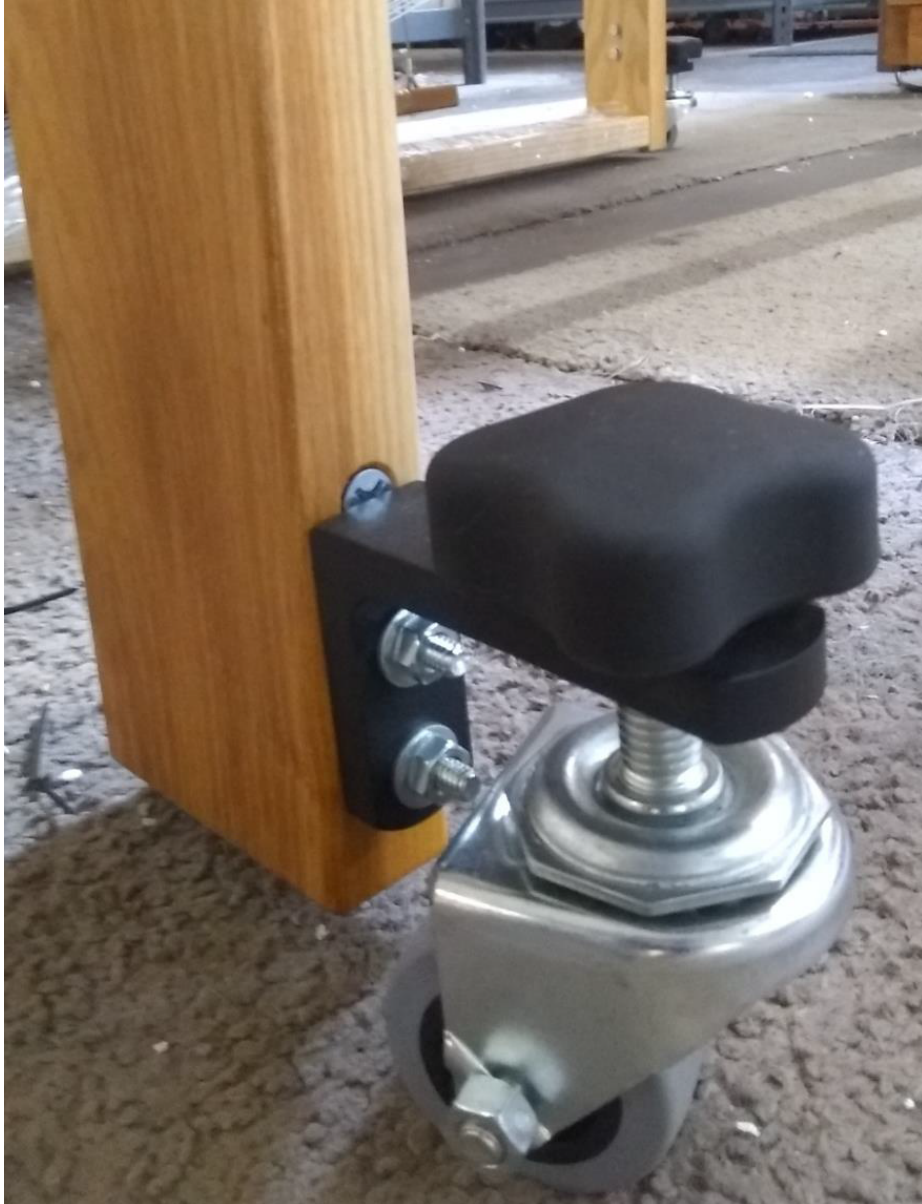
Figure 4 - Caster attached to rear leg of loom