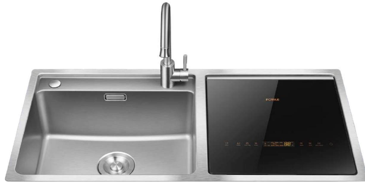
SD2F-P1X * Faucet is not included