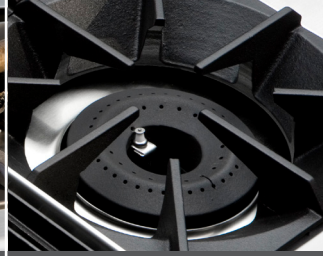
Power-Flo OpenTop Burner 25,000 btus/hr