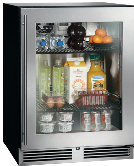
Glass Door Model