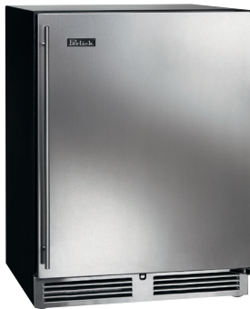
Solid Door Model

Perlick ® QUALITY & INNOVATION THAT INSPIRES