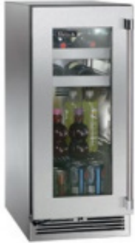
Glass Door Model