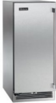
Solid Door Model