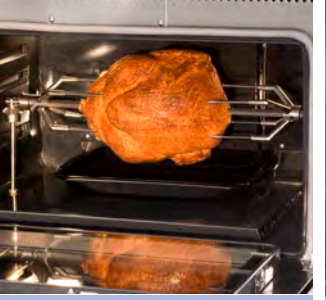
Integrated Motorized Rotisserie