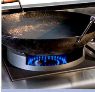
Cast Iron Accessory Wok Grate