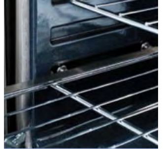
Capital exclusive feature: Flex-Rolls oven racks