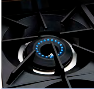
8,000 BTU Small Pan Burner