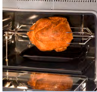
Integrated Motorized Rotisserie