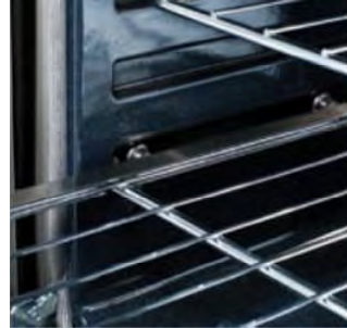
Capital exclusive feature: Flex-Rolls oven racks