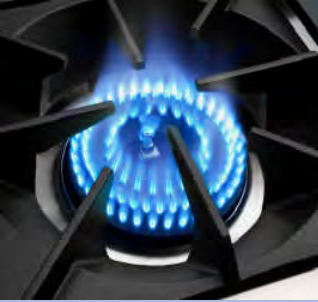
Power-Flo Open Burner 25,000 BTU