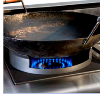
Cast Iron Accessory Wok Grate