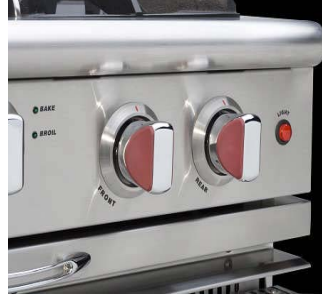
Optional Cabernet red knobs