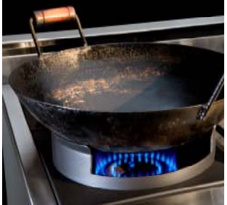
Cast Iron Wok Grate Accessory