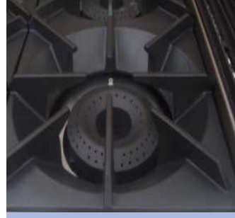
High Quality Porcelanized Top Grate